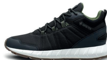
10062-0204 Black-Green (RCEA23)