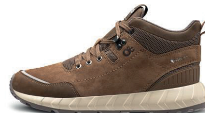
10034-0008 Brown (CO-2022EA)