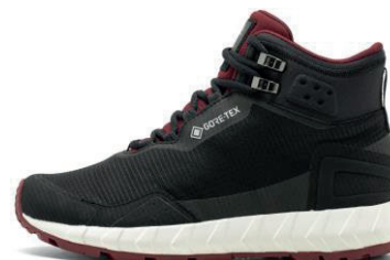
10002-0252 Black-Dark Red