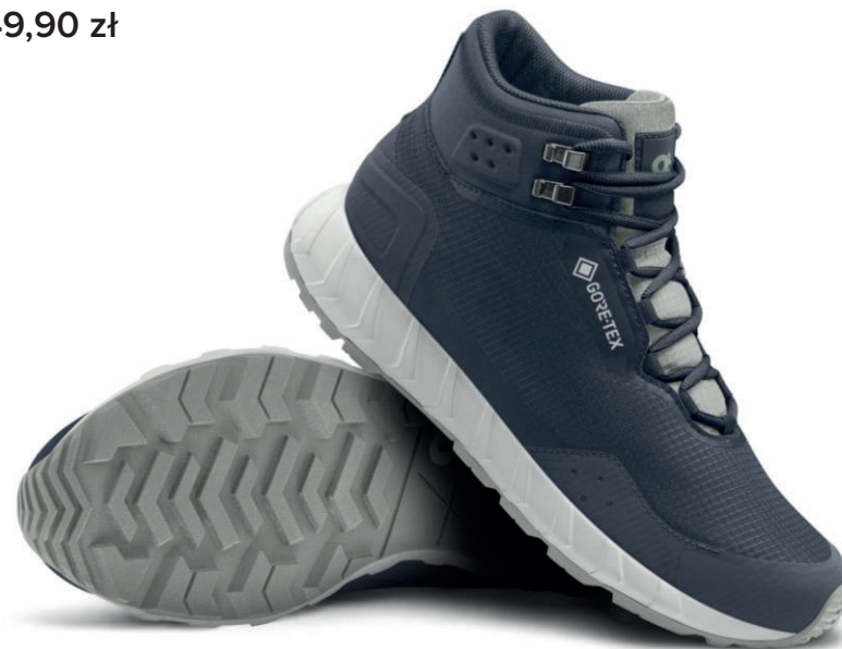
10002-0076 Dark Blue