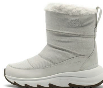
10111-0020 Off White