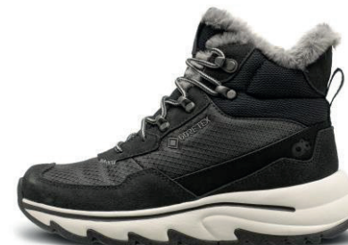
10097-0002 Black (RCFW23)