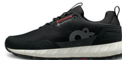
10063-0201 Black (COFW21)