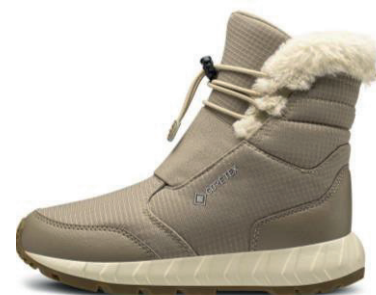
10009-0038 Beige (COFW23)