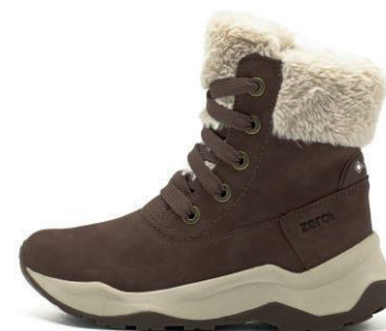
10031-0008 Dark Brown (CO-2021Q3)