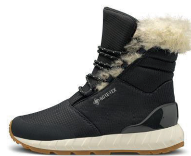
10004-0002 Black (CO-2022Q3)