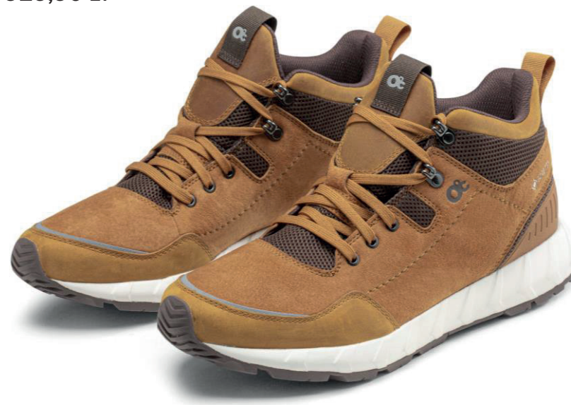
10034-0058 Cognac (COFW20)