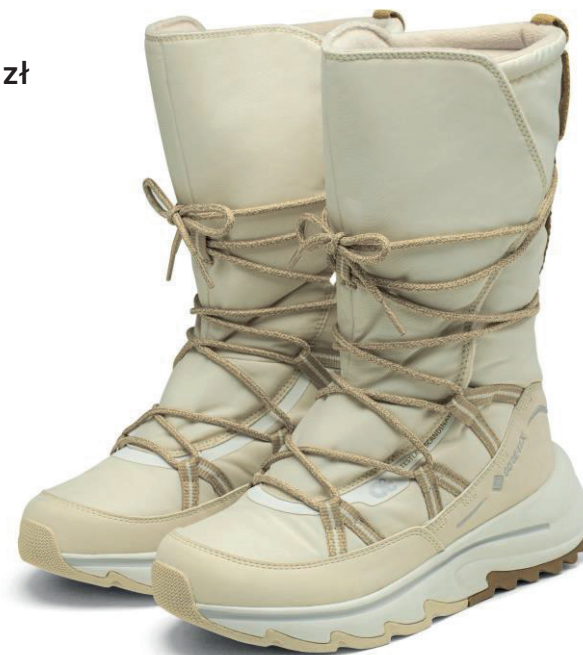
10096-0038 Beige (RCFW23)