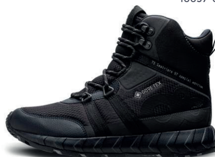
10057-0202 Black-Black (CO-2022O3)