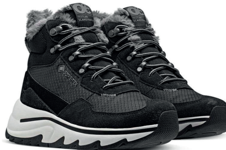
10097-0002 Black (RCFW23)