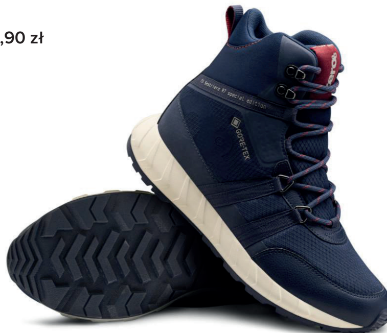
10057-0005 Navy (CO-2021O3)