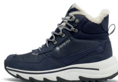
10097-0005 Navy (RCFW23)