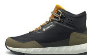
10001-0208 Black-Brown (CO-2022EA)