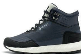
10001-7603 Dark Blue-Grey