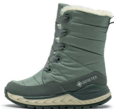
10113-0085 Light Green