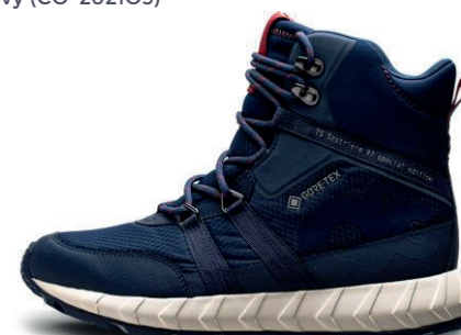
10057-0005 Navy (CO-2021O3)