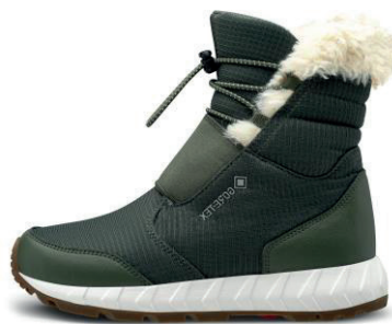
10009-0037 Olive (COFW23)