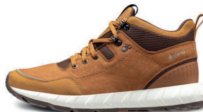
10034-0058 Cognac (COFW20)