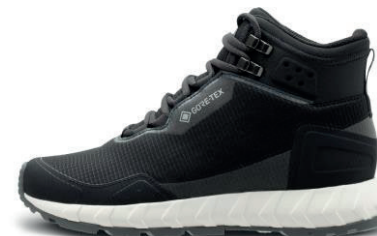
10002-0002 Black (RCFW19)