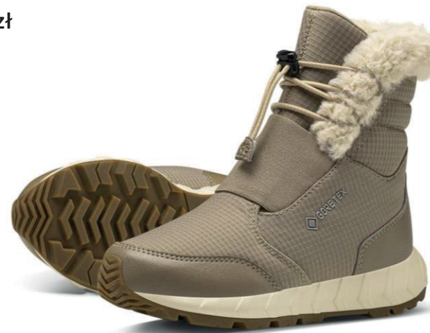
10009-0038 Beige (COFW23)