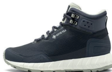
10002-0076 Dark Blue