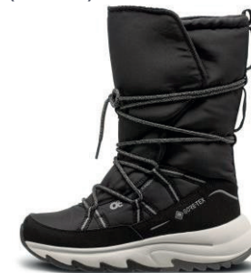
10096-0002 Black (RCFW23)