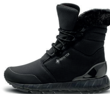
10004-0202 Black-Black (CO-2019Q3)