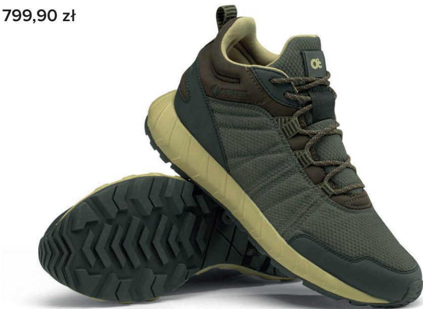
10062-3708 Olive-Brown (RCEA23)