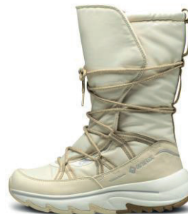
10096-0038 Beige (RCFW23)