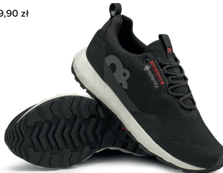
10063-0201 Black (COFW21)