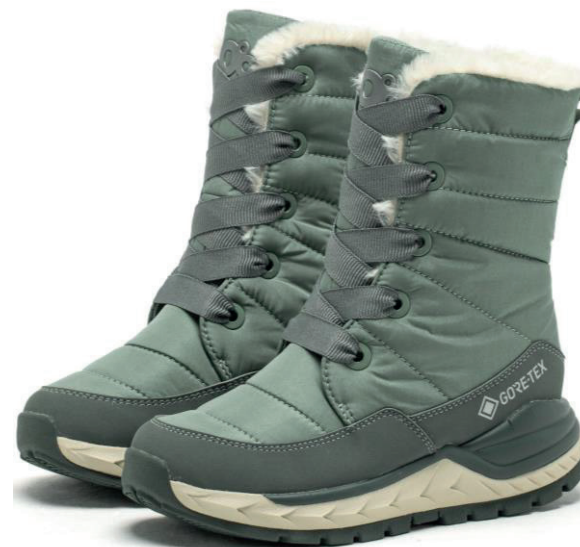
10113-0085 Light Green