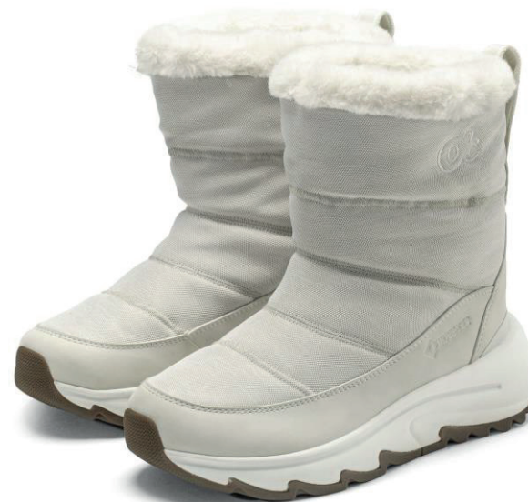
10111-0020 Off White