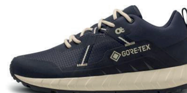
10088-0076 Dk.Blue (COSS24)