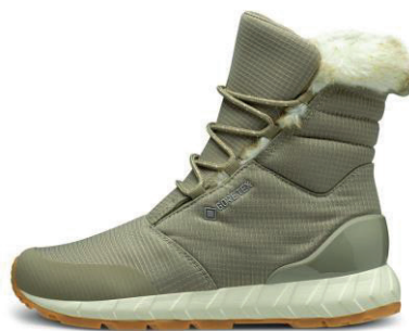
10004-0038 Beige (RC-2022Q3)