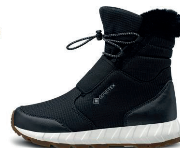
10009-0002 Black (COFW23)