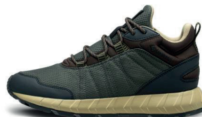
10062-3708 Olive-Brown (RCEA23)