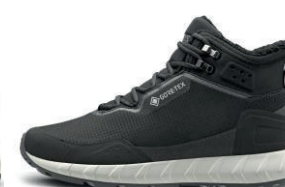
10041-0201 Black (CO-2022EA)