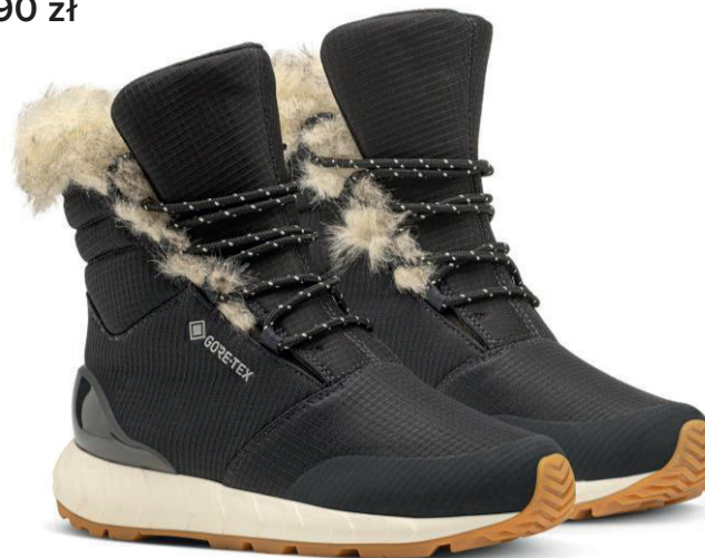
10004-0002 Black (CO-2022Q3)