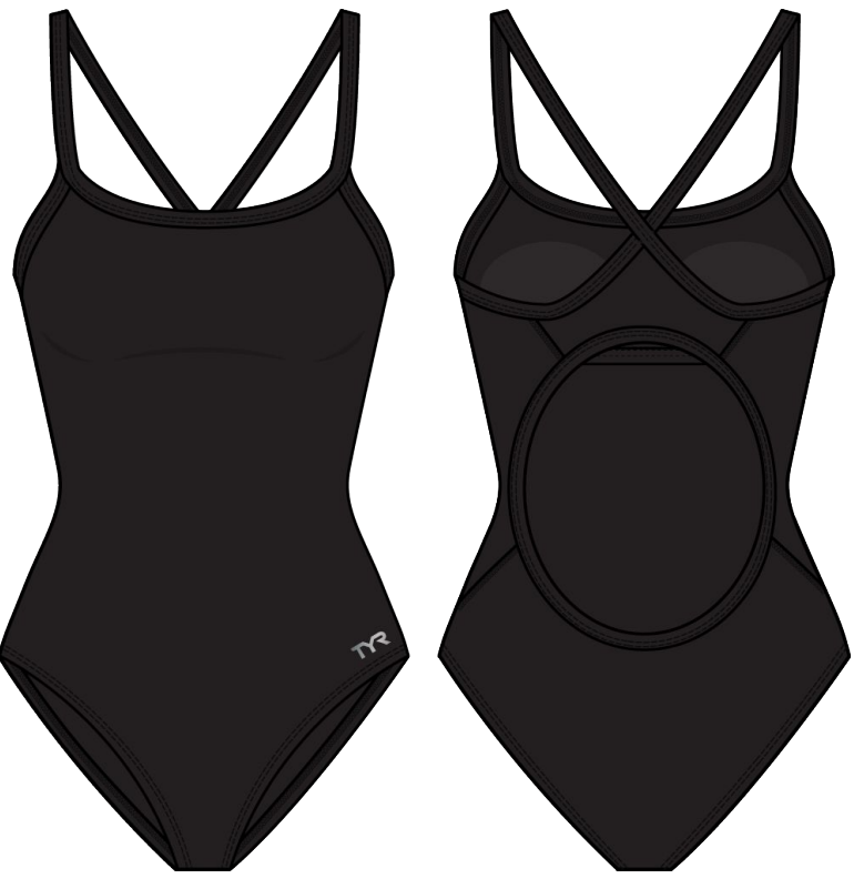
DFSO7A 001 BLACK CARRYOVER