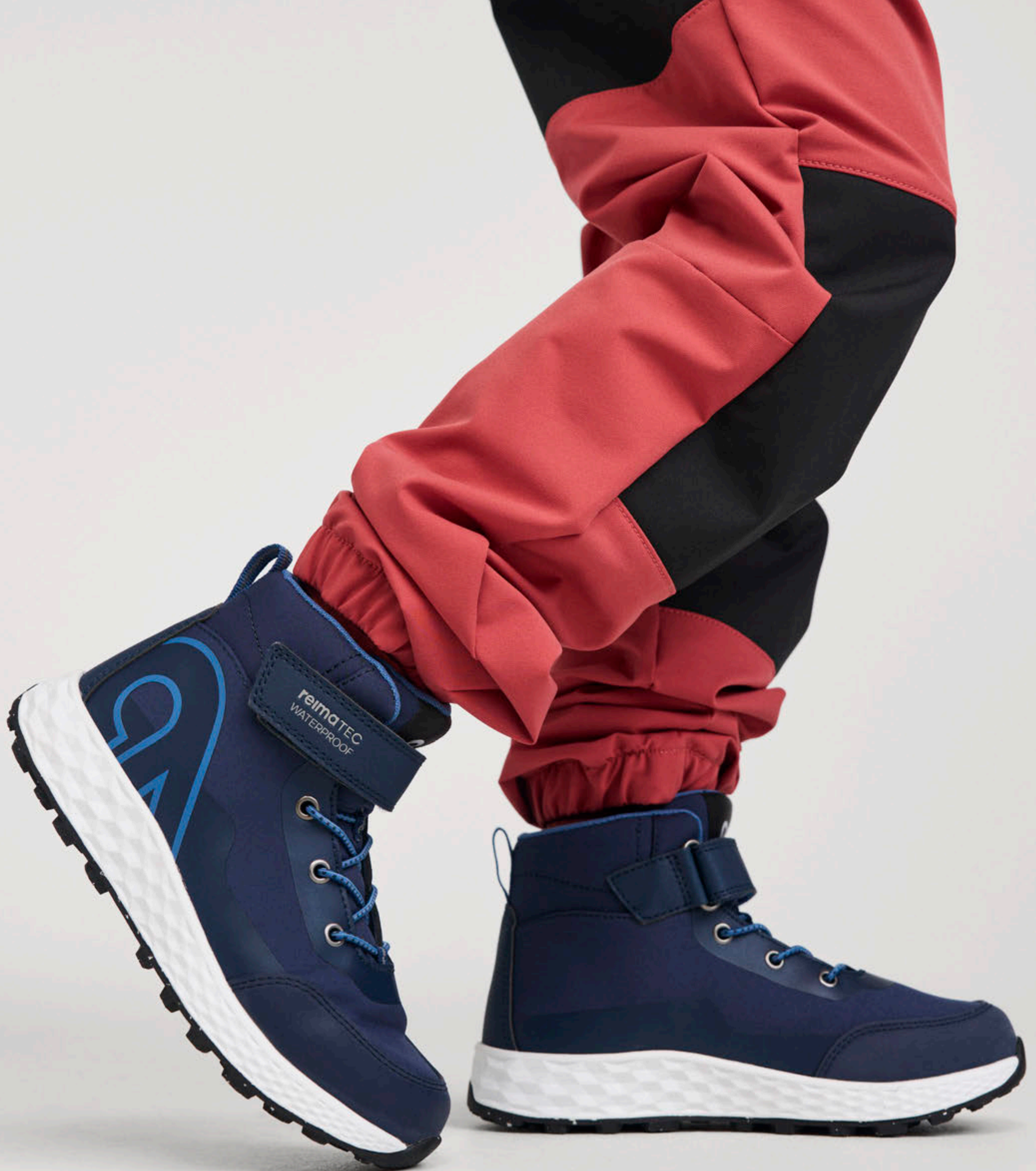
5400018B HIIPIN ReimaTec shoes