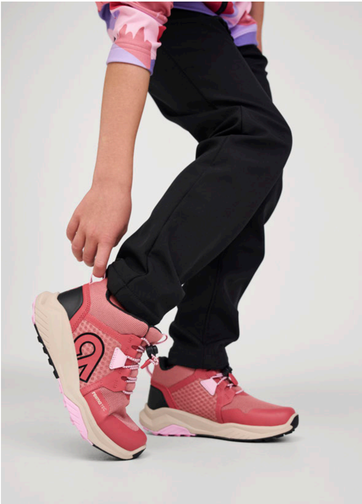
5400134B KIRITIN REIMATEC SHOES