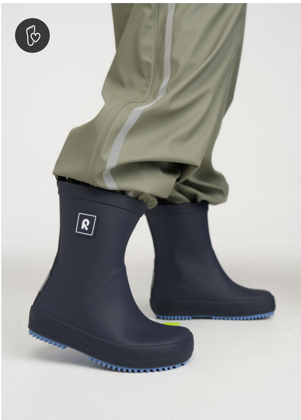
5400158A ANKKA BAREFOOT RAIN BOOTS