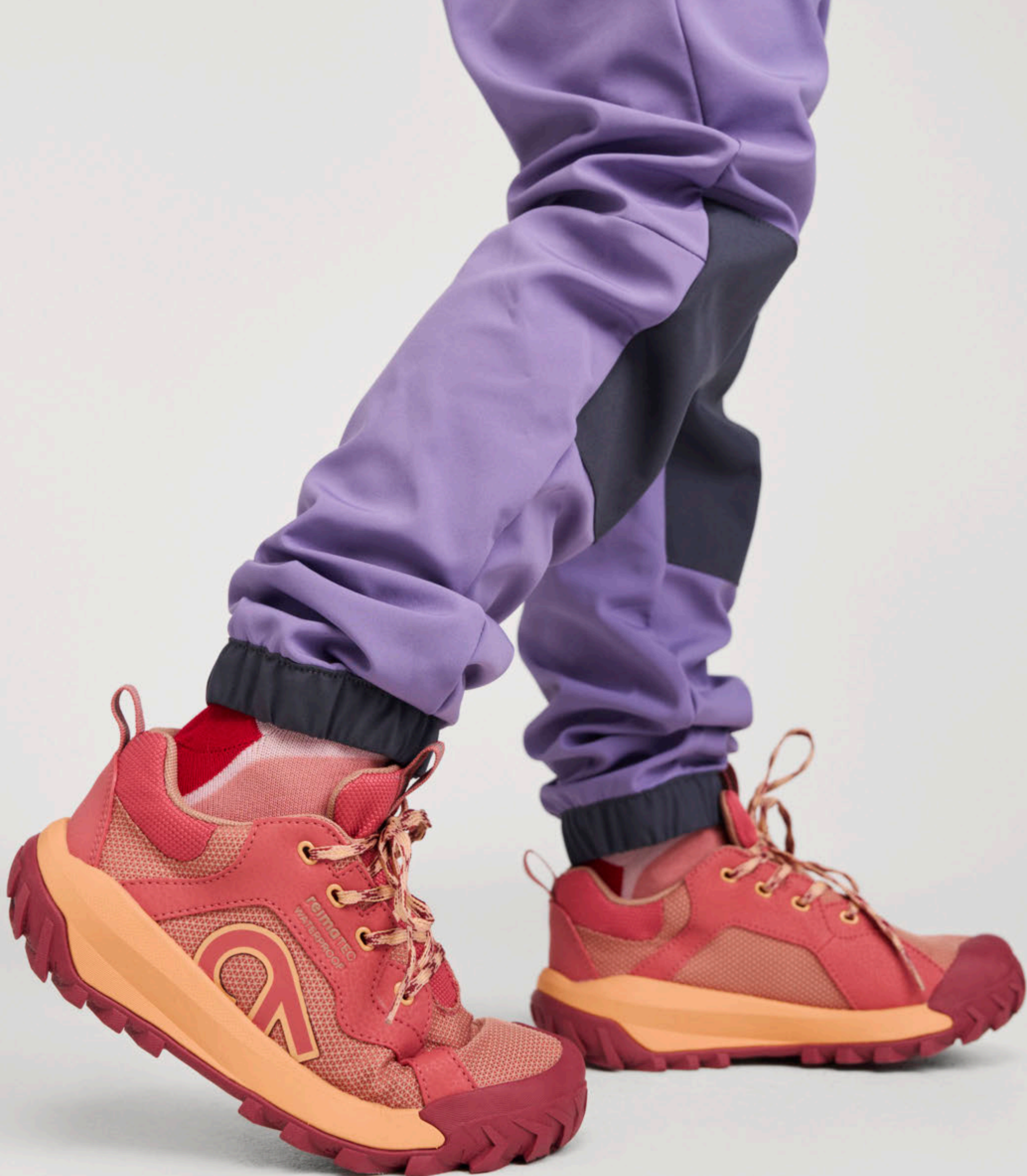
5400179A KULKURI LOW ReimaTec shoes