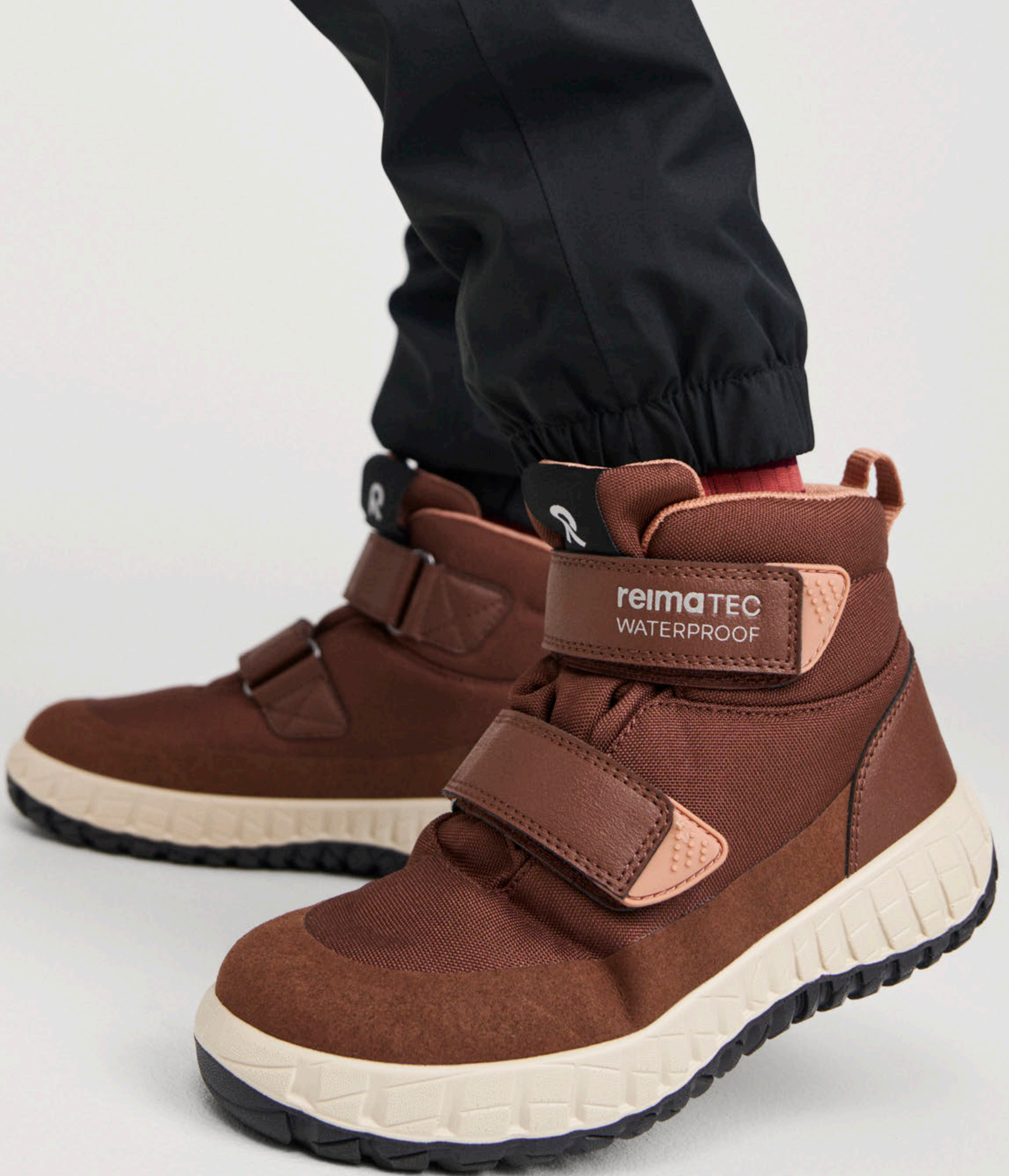
5400042A PATTTER 2.0 ReimaTec shoes