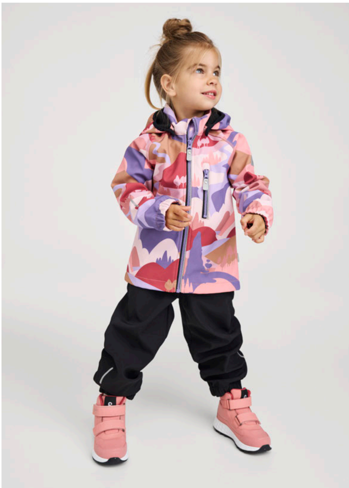
5400145M HIIVIN MOOMIN REIMATEC SHOES