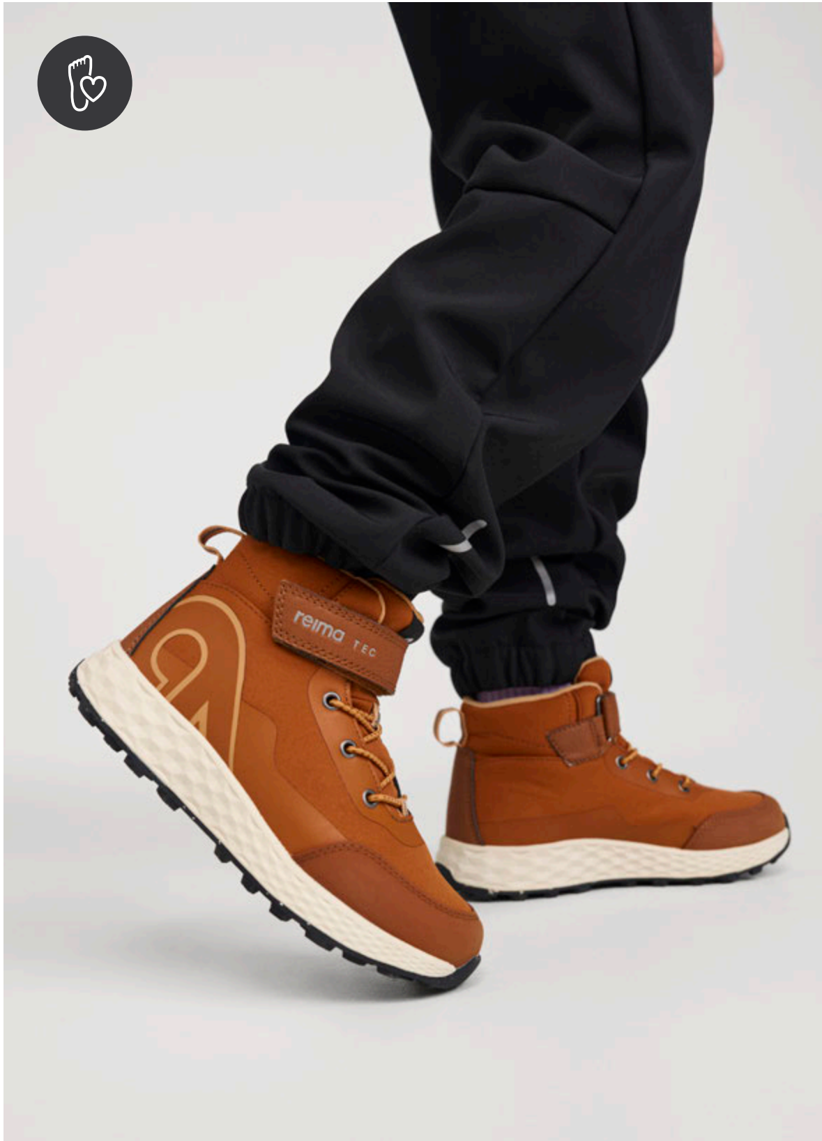
5400018B HIIPIEN REIMATEC SHOES