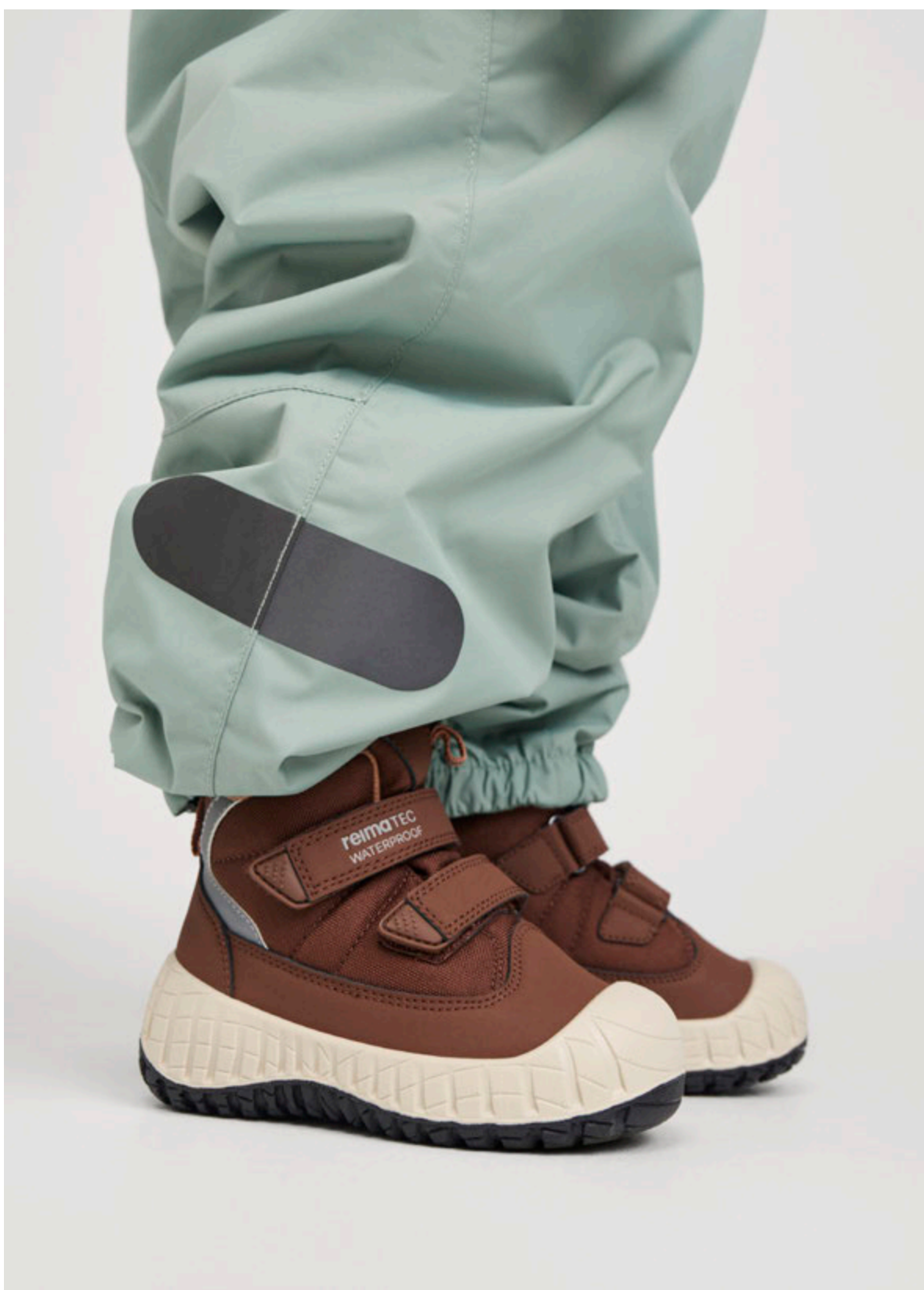
5400010A PASSO 2.0 REIMATEC SHOES