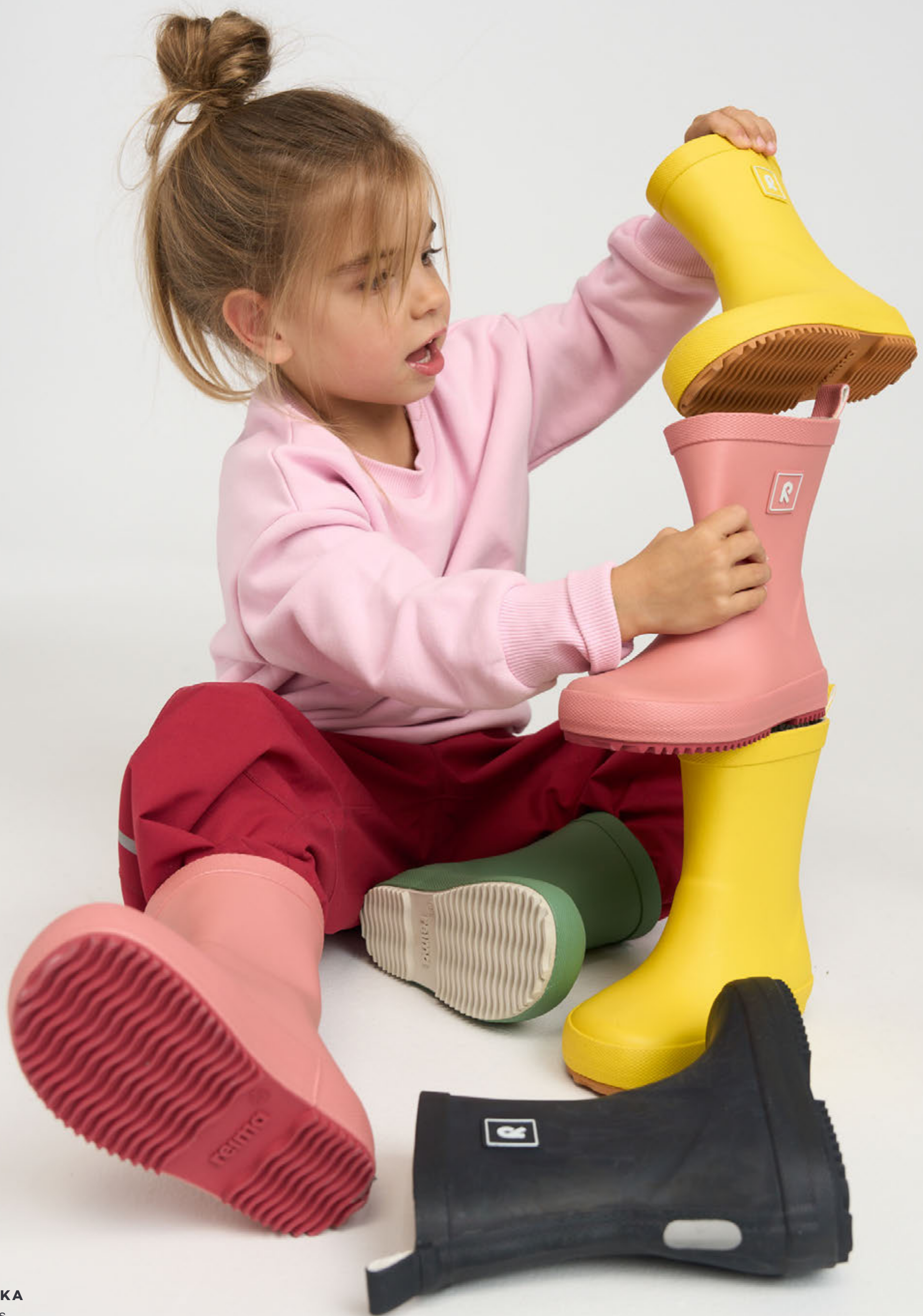
5400158A ANKKA Barefoot rain boots