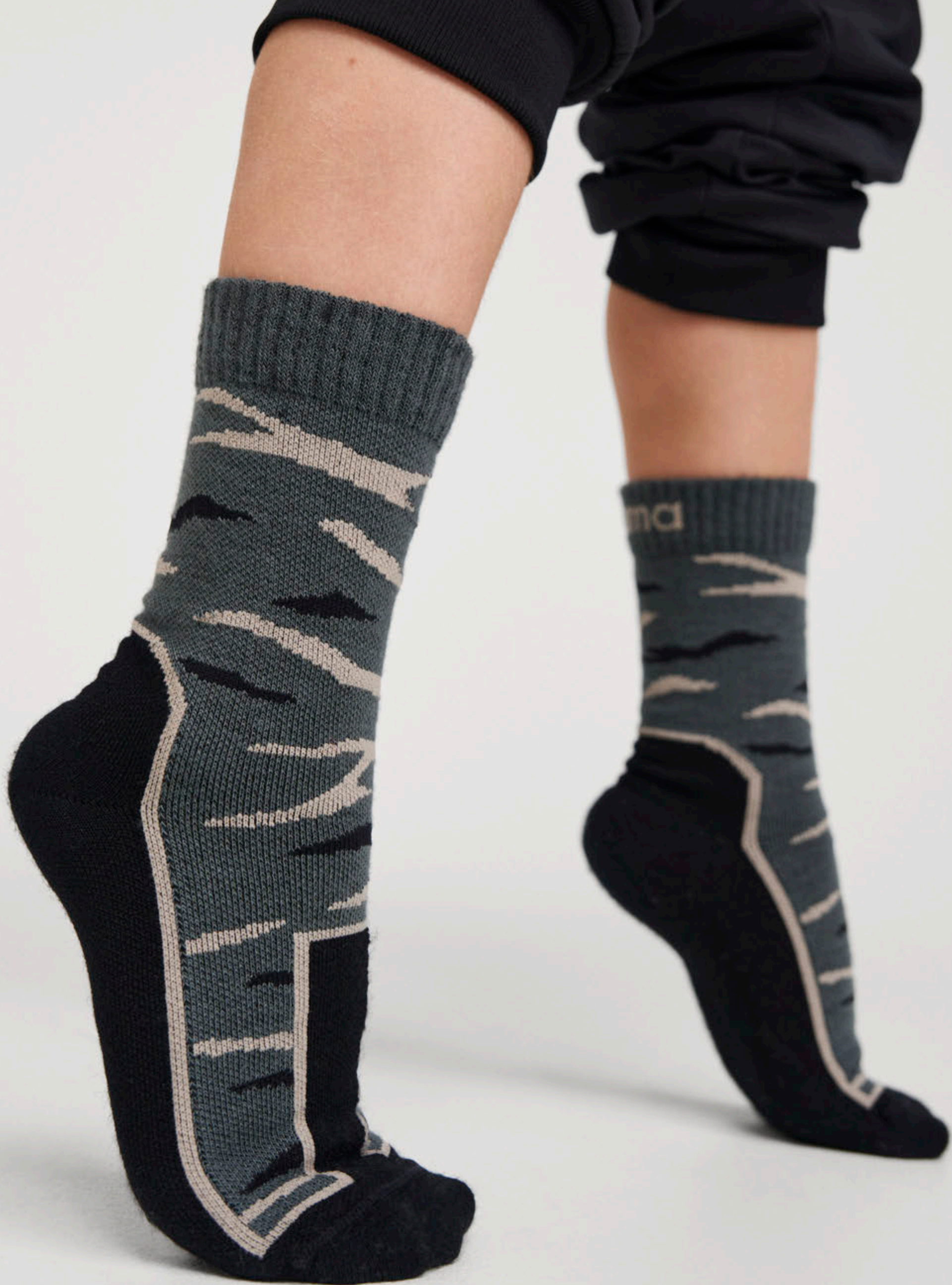
5300368A KUIVILLA socks