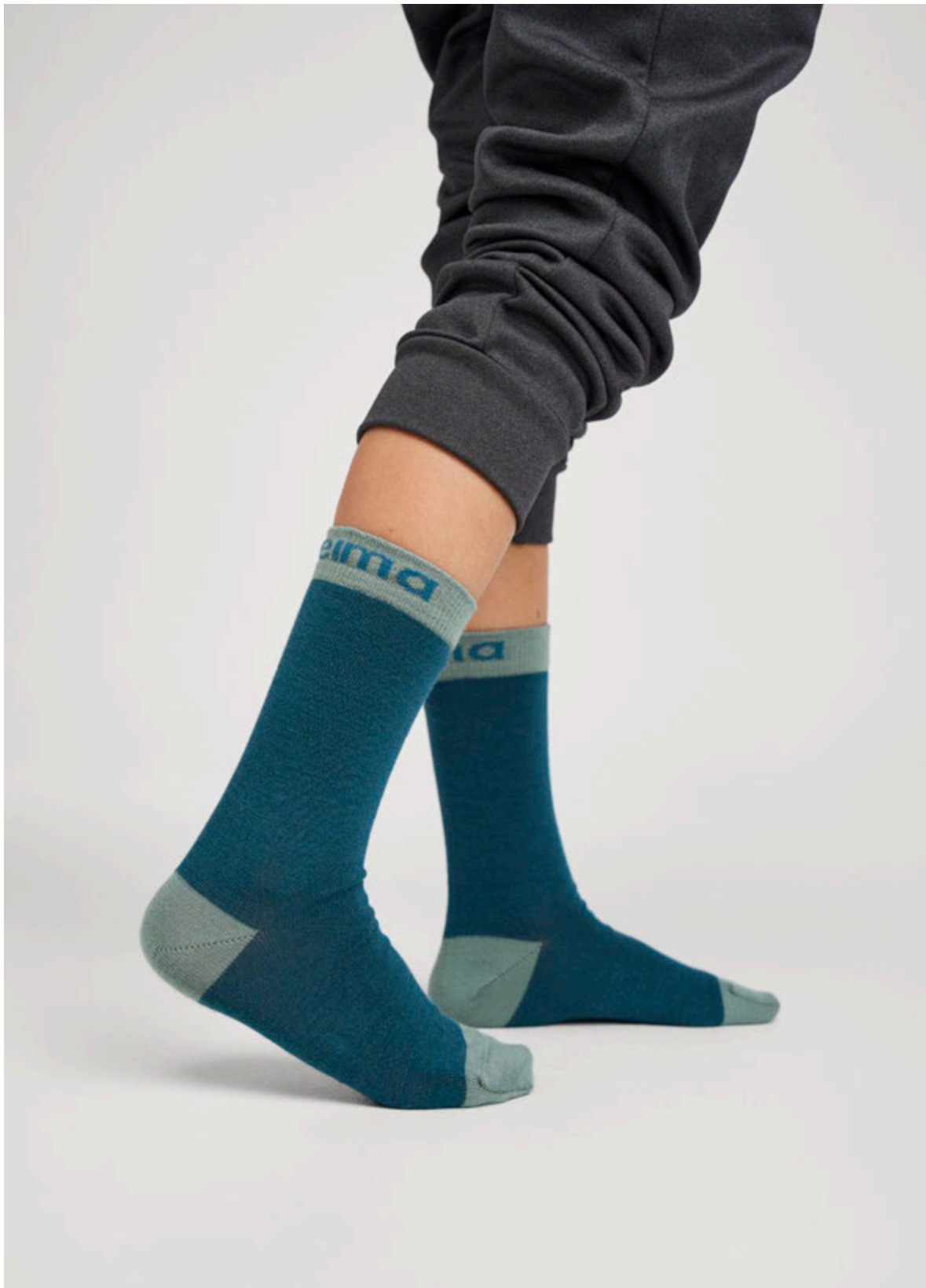
5300309A PARIT SOCKS