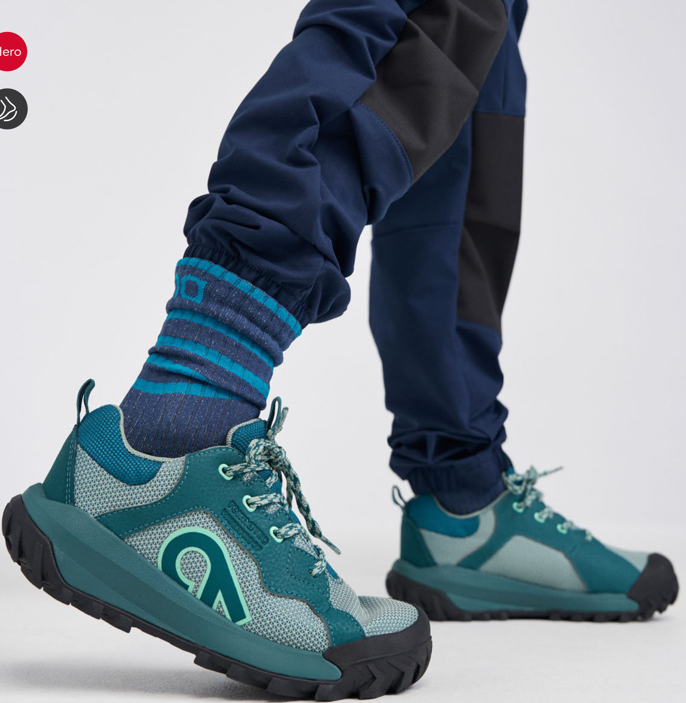
5400179A KULKURI LOW ReimaTec shoes