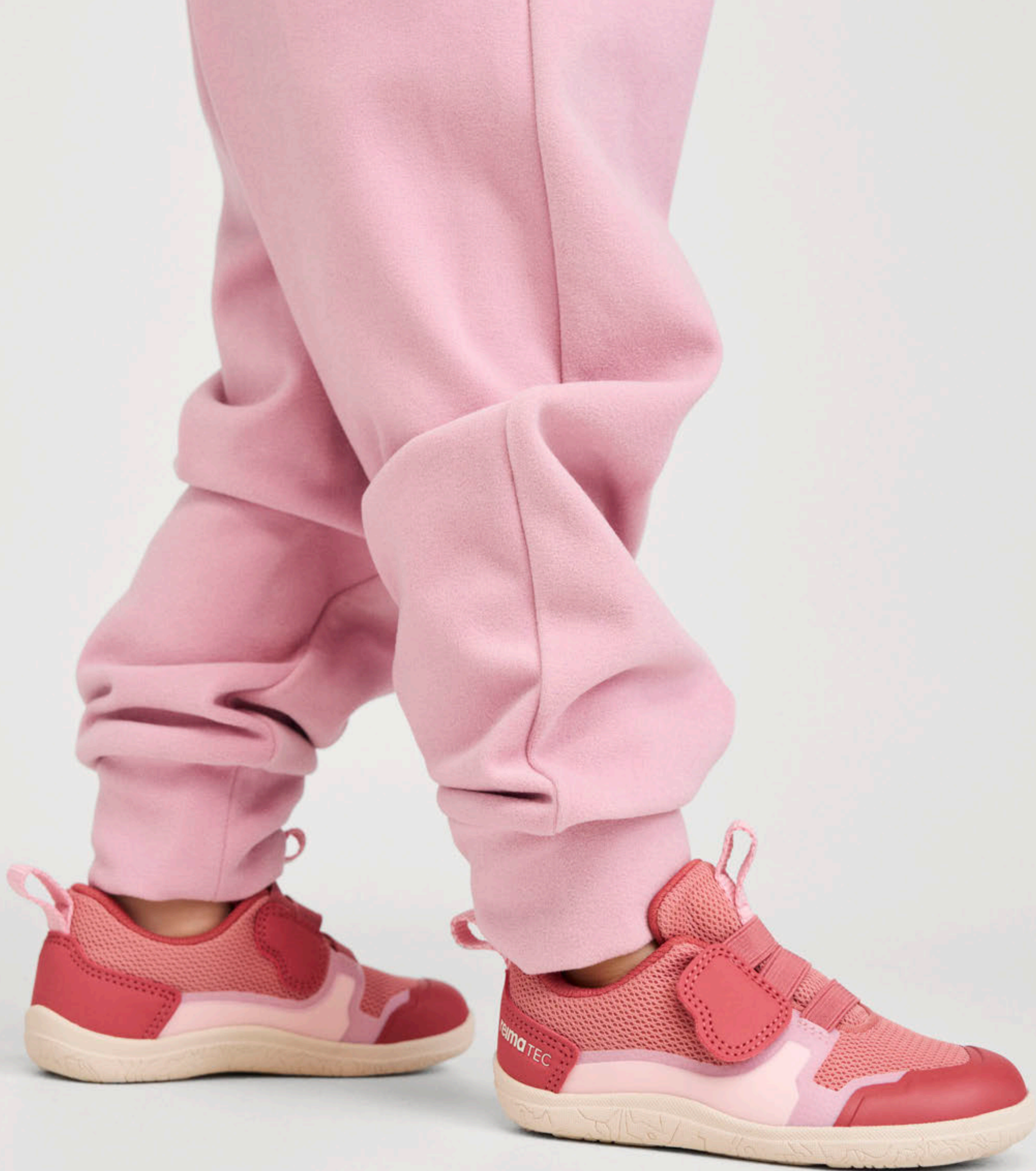
5400141B TEPASTELU ReimaTec barefoot shoes