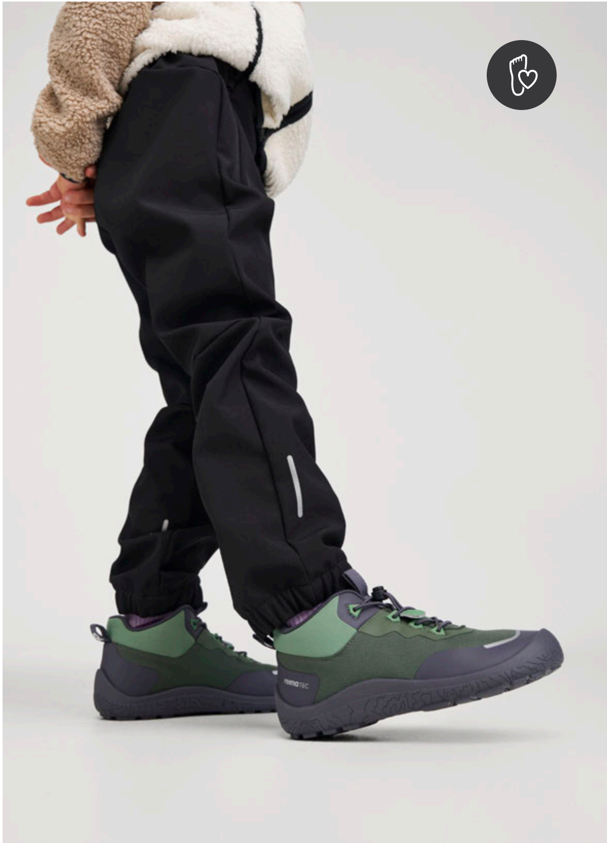
5400160B SANKARI REIMATEC BAREFOOT SHOES