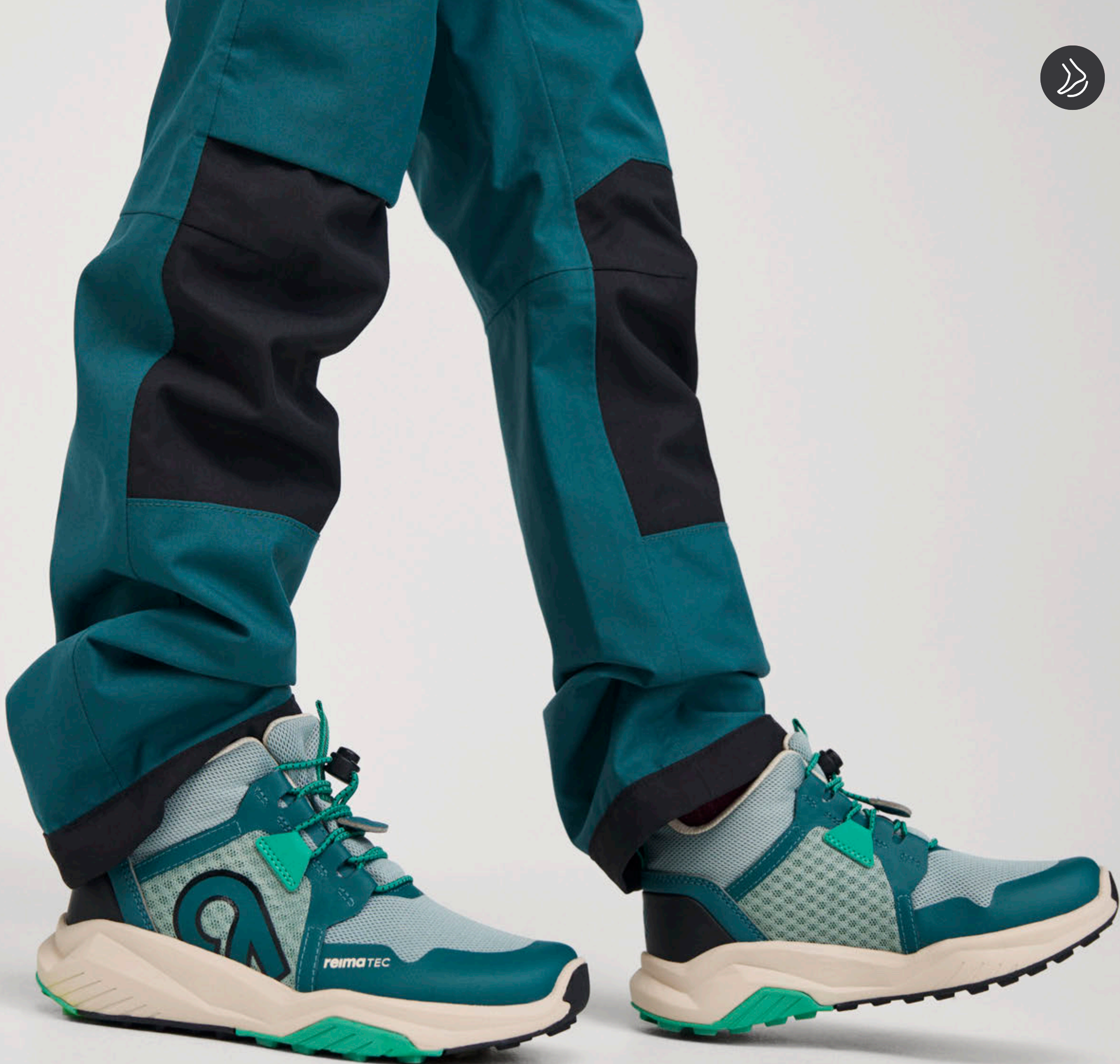
5400134B KIRITIN ReimaTec shoes