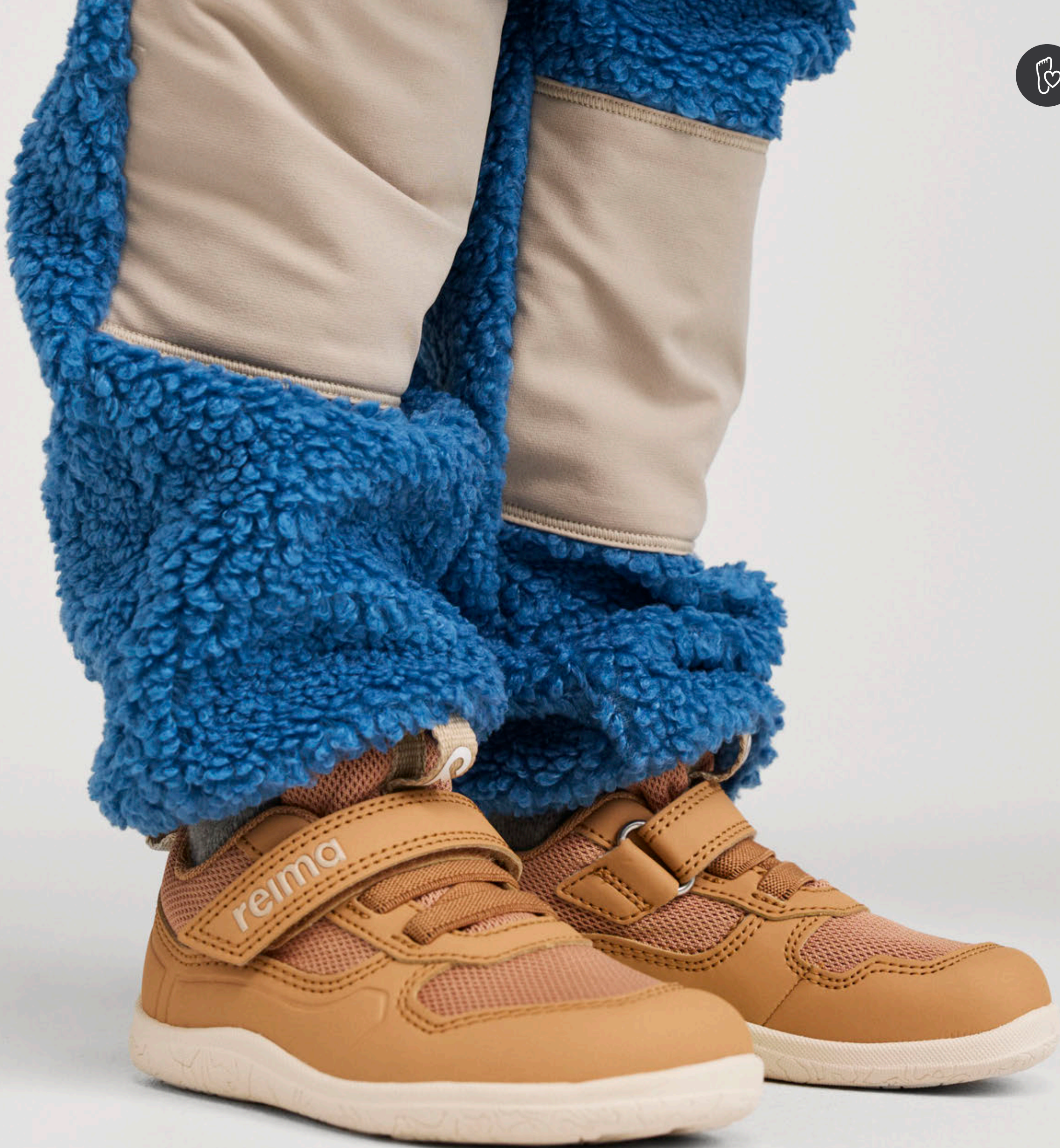
5400175A TELMIN KIDS ReimaTec barefoot shoes