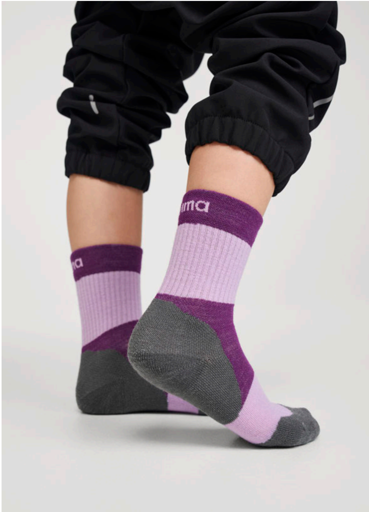
5300277B PATIKKA SOCKS