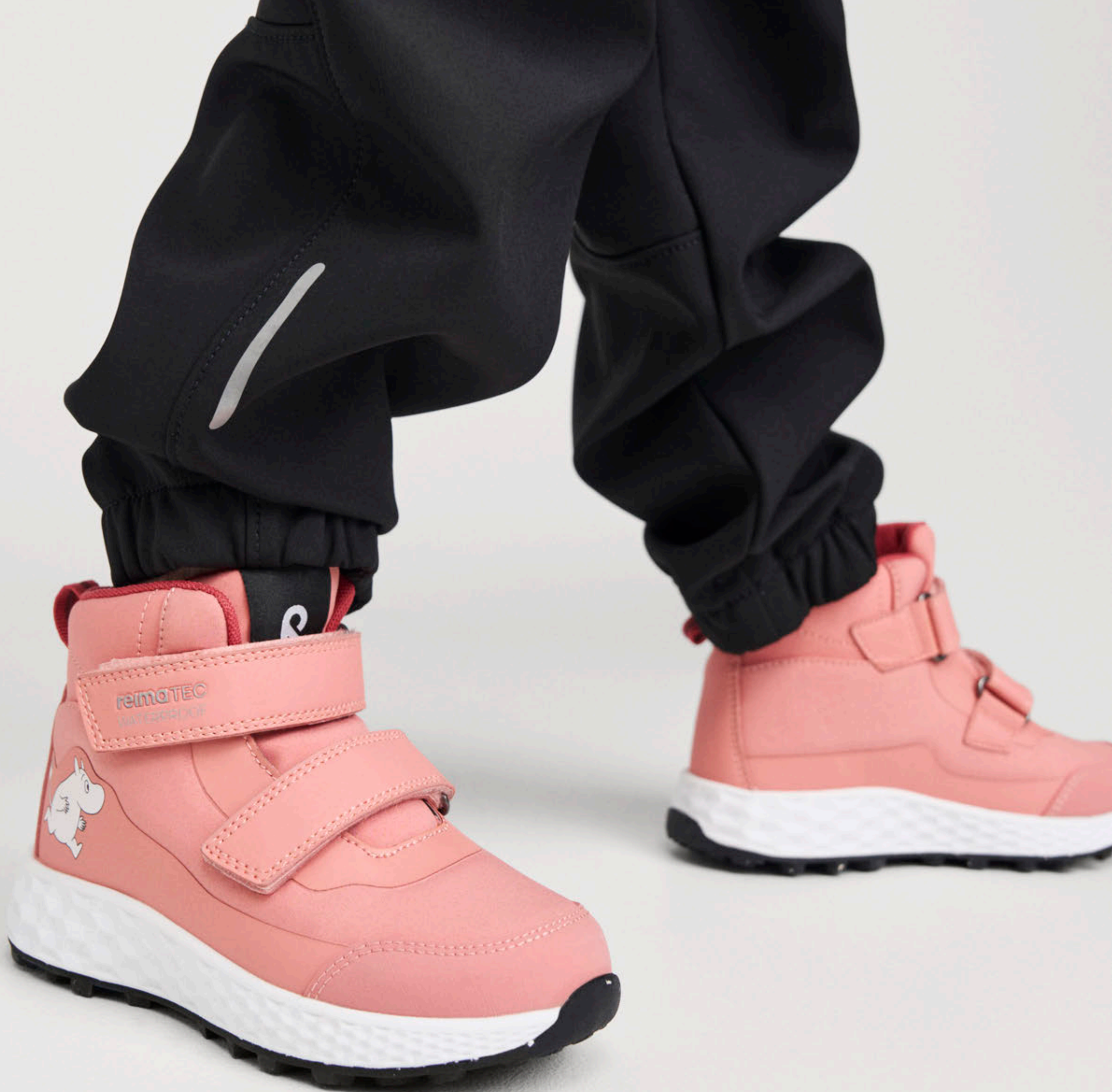
5400145M HIIVIN MOOMIN ReimaTec shoes