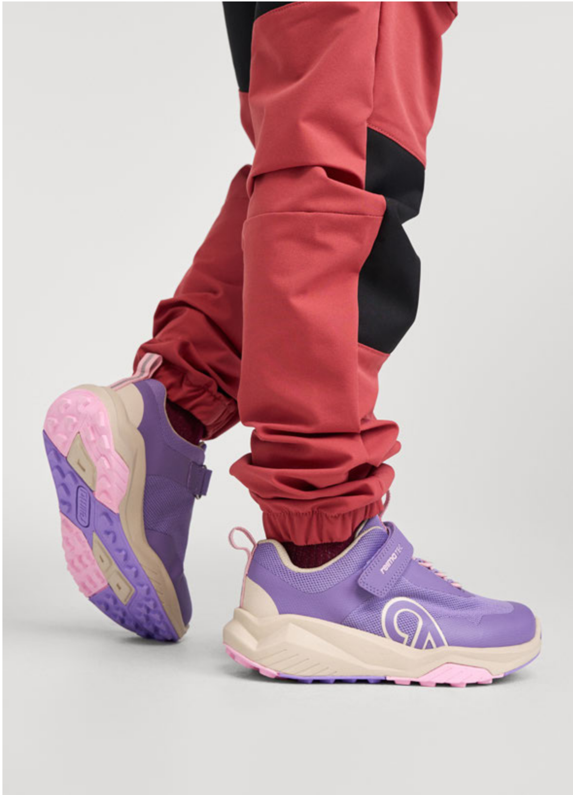
5400152C ENKKARI REIMATEC SNEAKERS