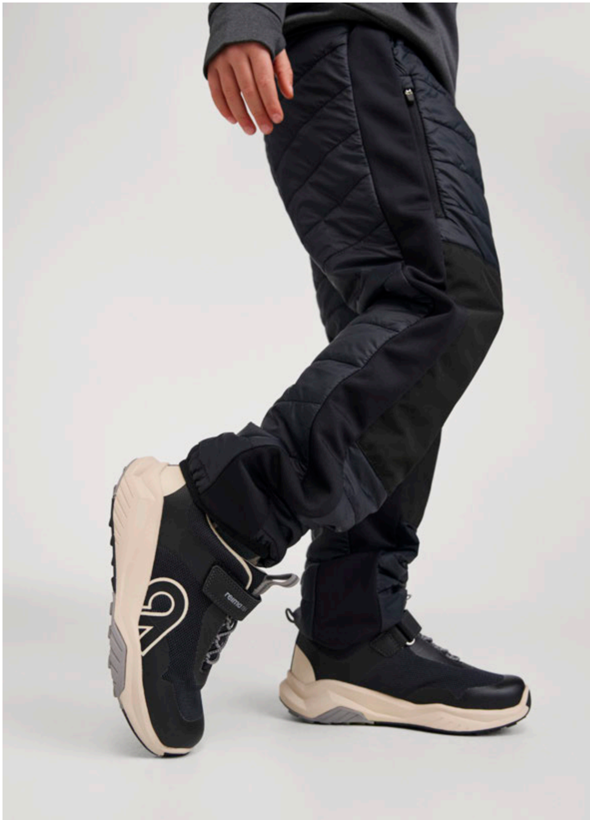
5400152C ENKKARI REIMATEC SNEAKERS