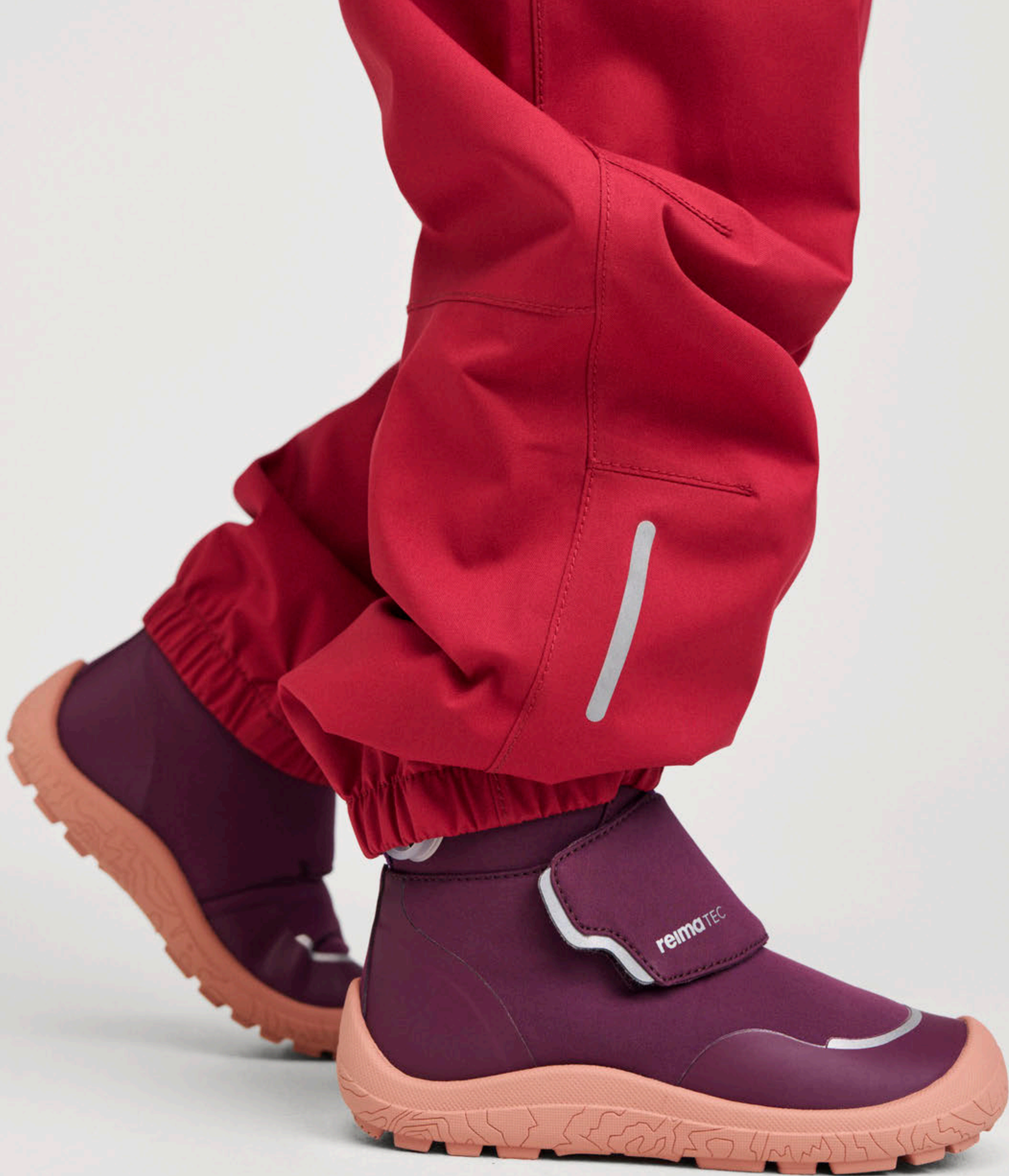
5400144B HYPPII ReimaTec barefoot shoes