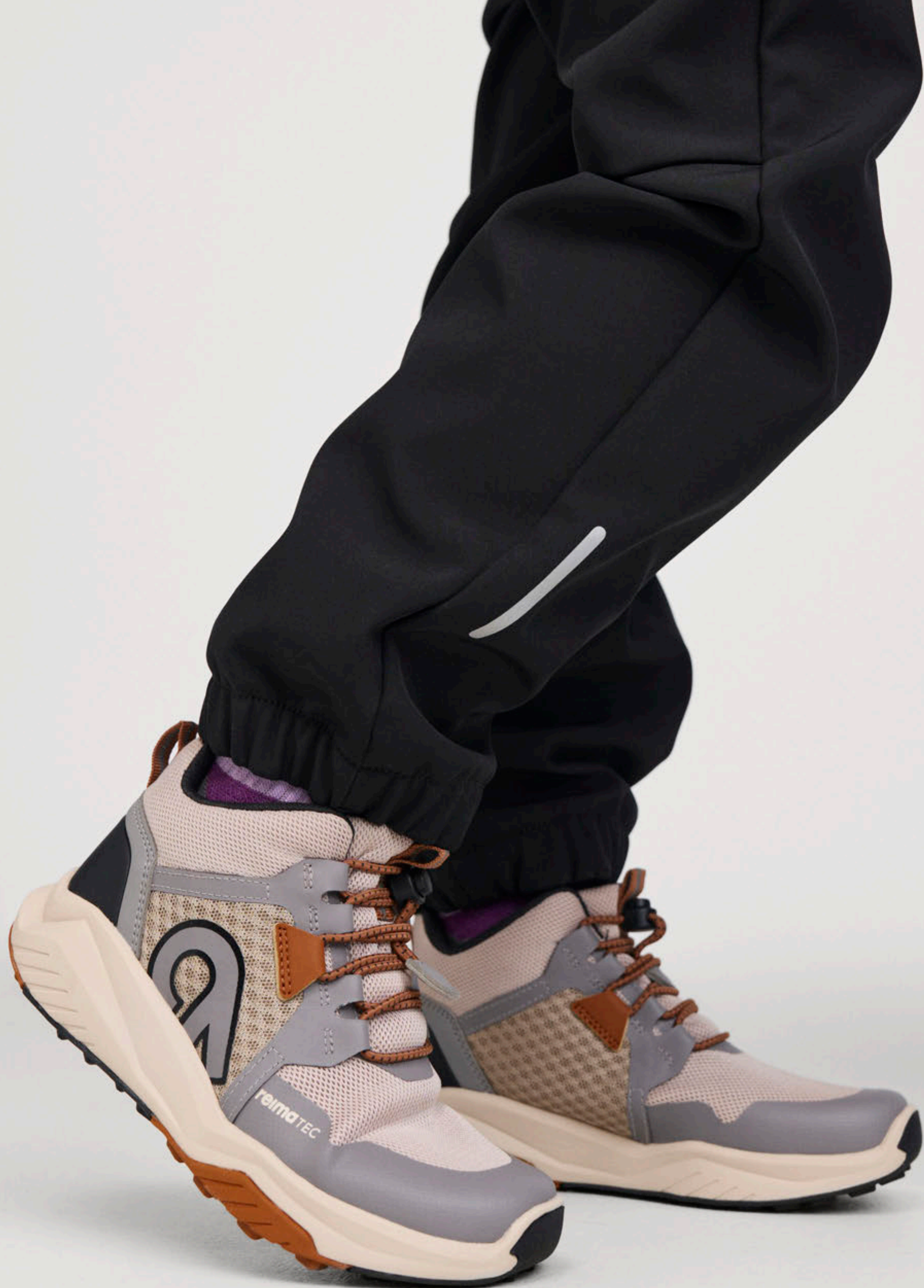
5400134B KIRITIN ReimaTec shoes