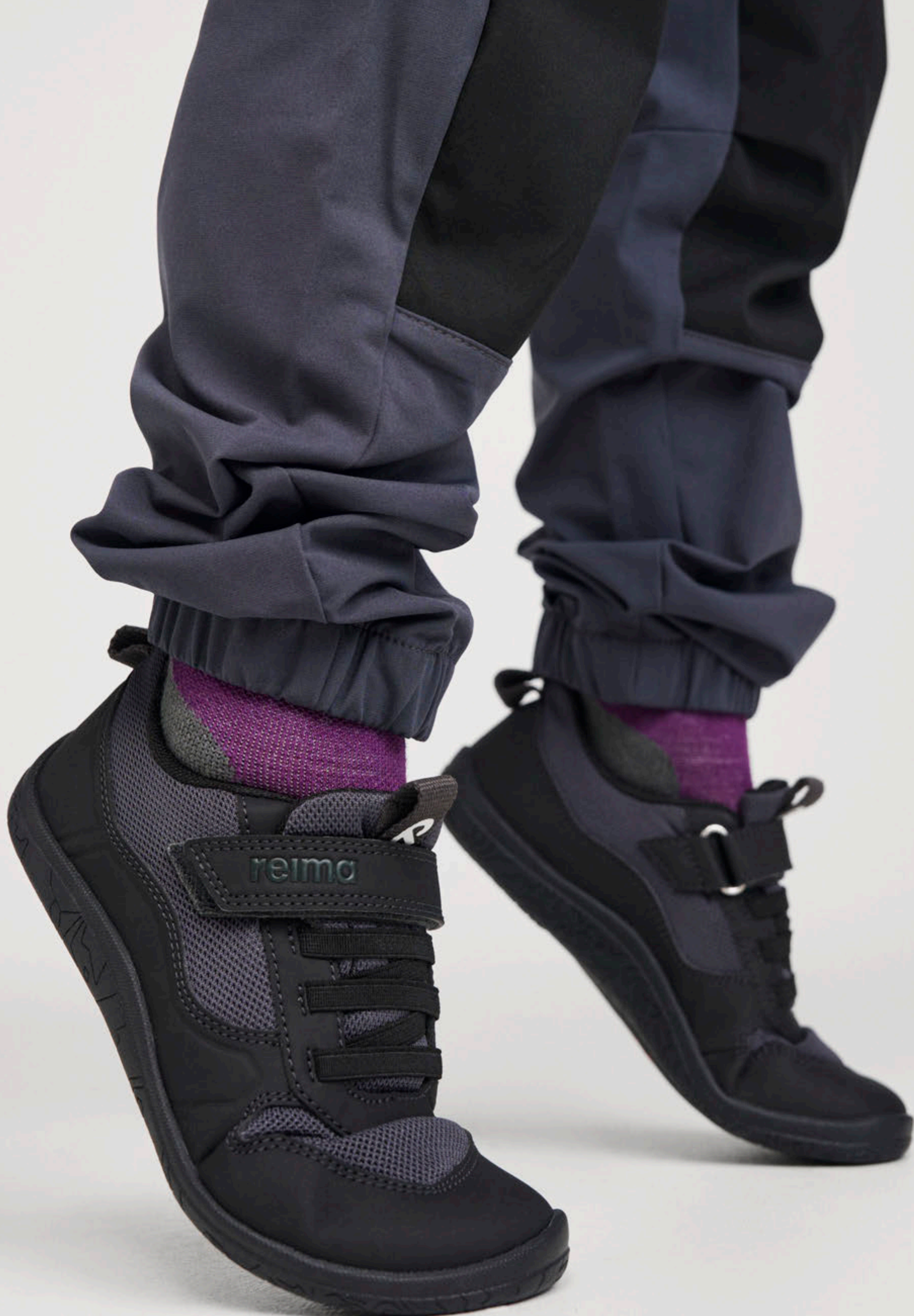
5400176A TELMIN JUNIOR ReimaTec barefoot shoes