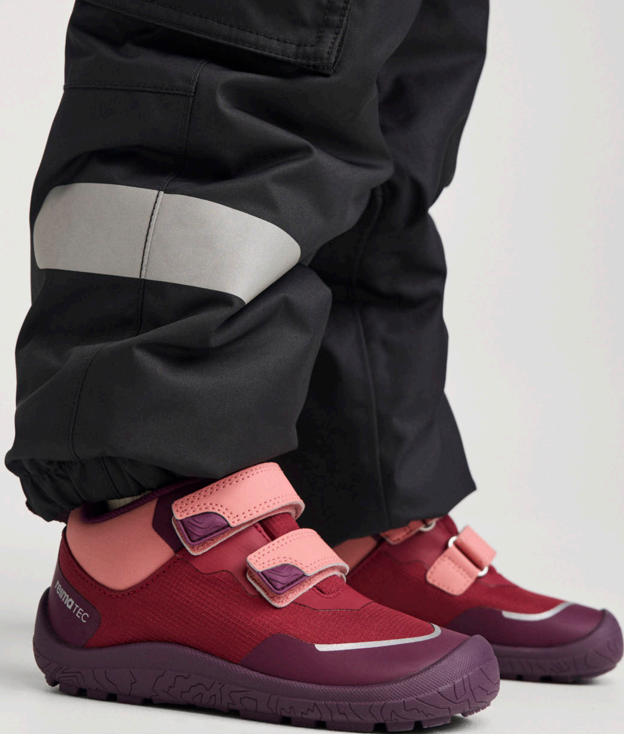
5400159B VIKARI ReimaTec barefoot shoes