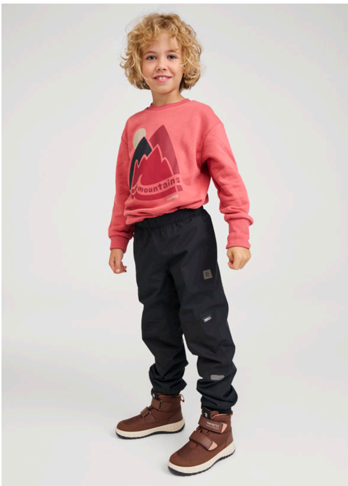
5400042A PATER 2.0 REIMATEC SHOES