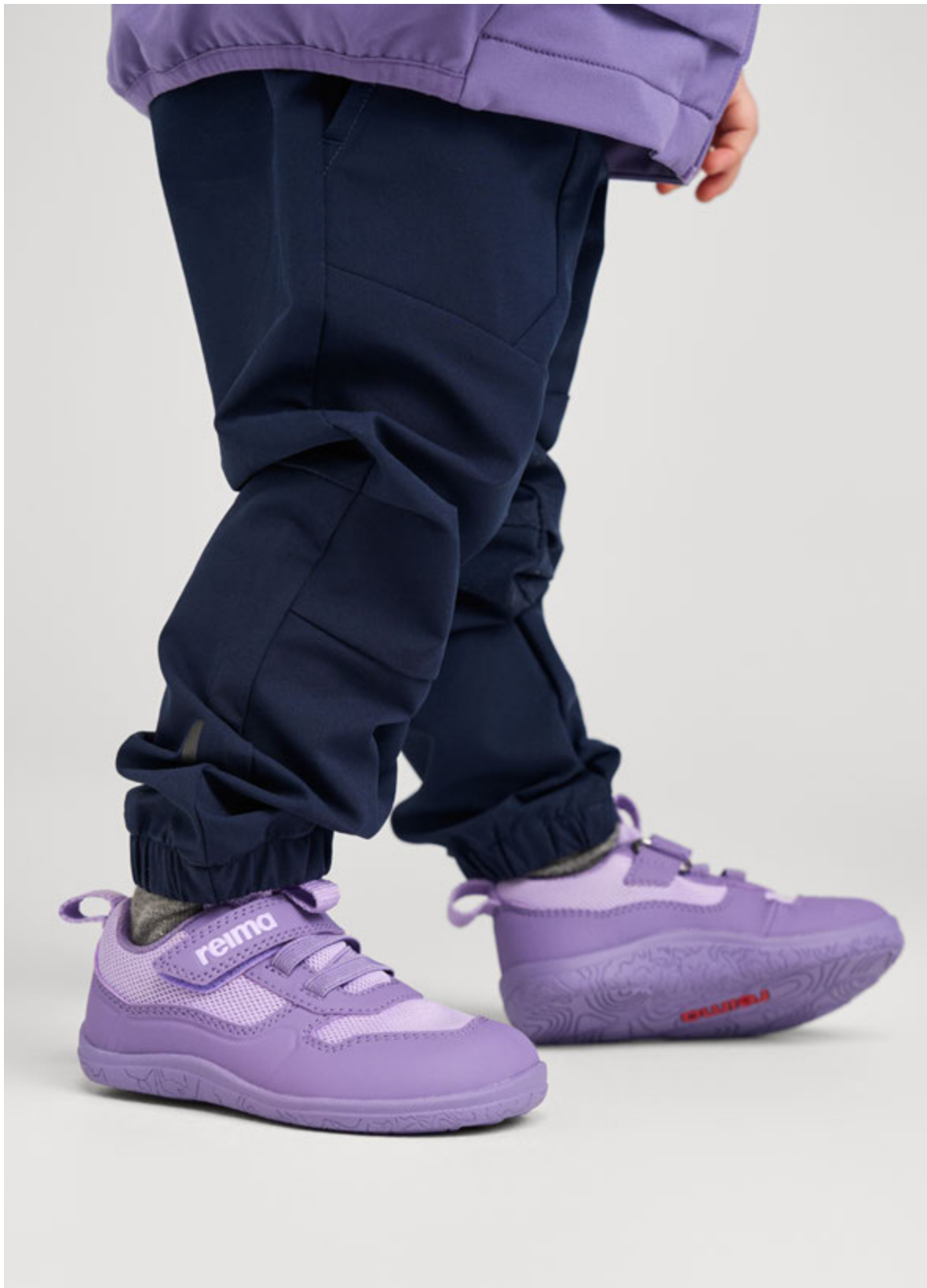
5400175A TELMIN KIDS