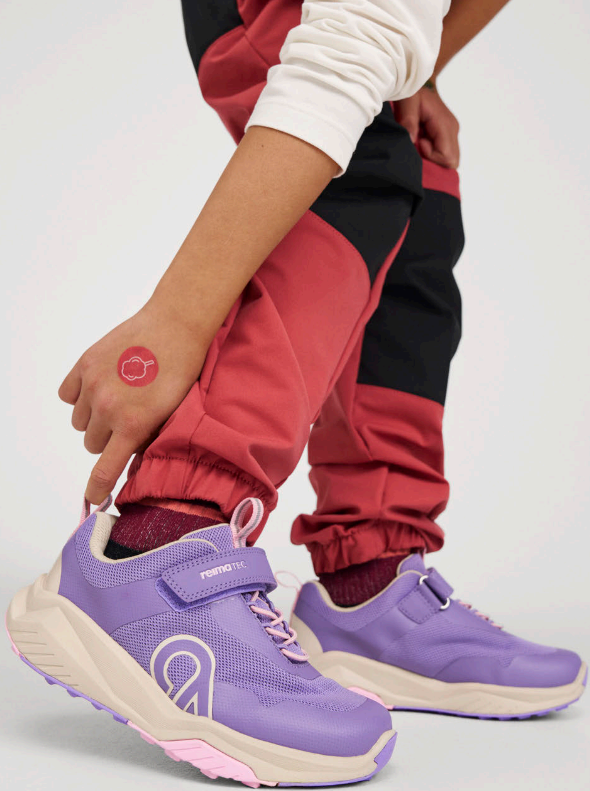
5400152C ENKKARI ReimaTec sneakers