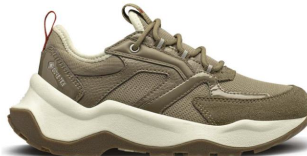
10042-6008 SLUSSEN GTX W/Sand/Brown