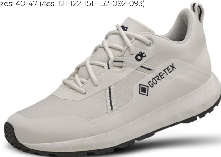
10089-0105 CITYHOPPER LOW GTX M White/Navy