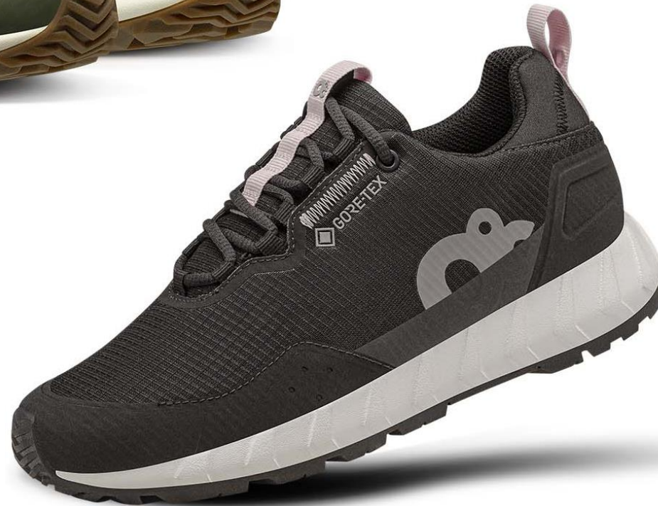
10064-0201 STORO CITYCROSS GTX W/Black/White

This is the low-cut version of our bestseller STORO MID. A low-cut classic sneaker with upper in rip-stop material, and no-sew welding's. A cool sneaker for those who want to look fashionable and good, and at the same time have a waterproof and breathable sneaker. A light and comfortable shoe to wear whether you chasing around in the city, are at work, or just prefer a comfortable walk in the park.