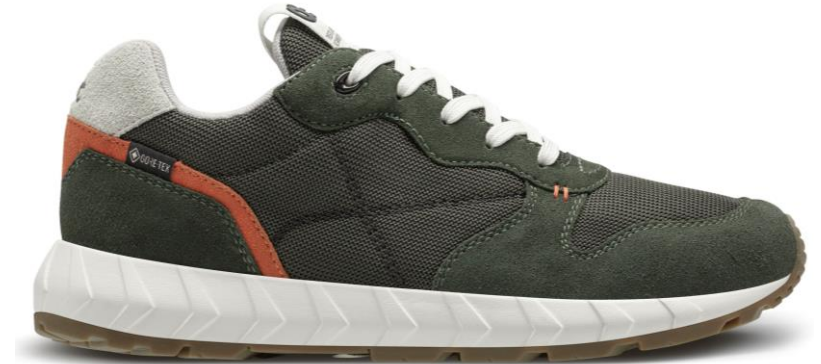
10073-0037 STUREPLAN GTX M/Olive