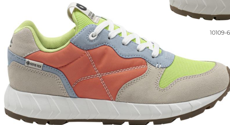
10109-3150 STUREPLAN MIX W GTX Orange/Multi