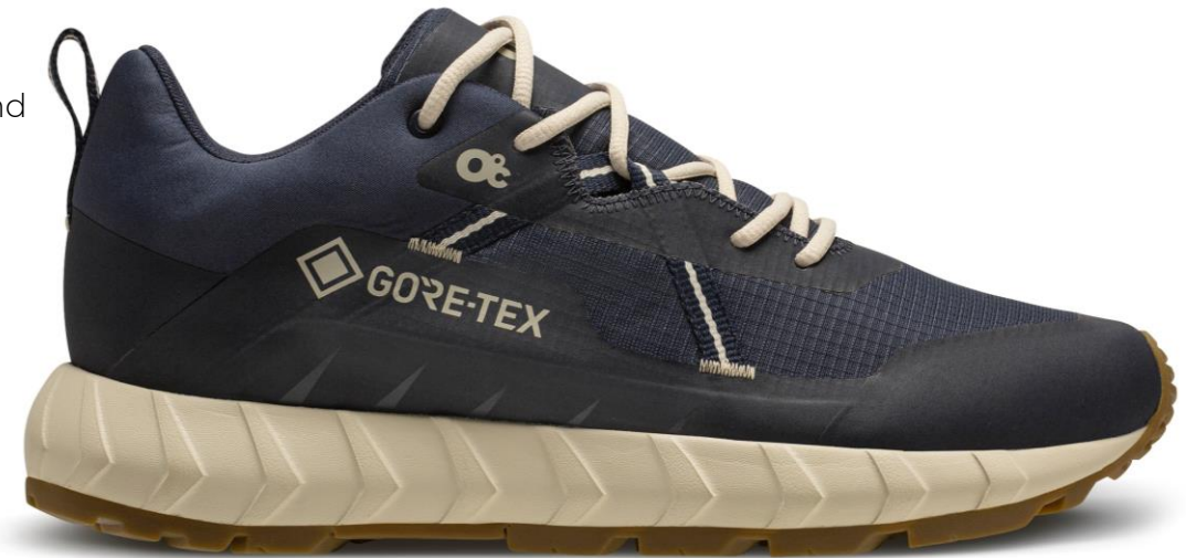
10089-0076 CITYHOPPER LOW GTX M Dark Blue