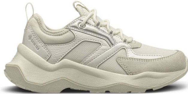
10042-0101 SLUSSEN GTX W/White/White