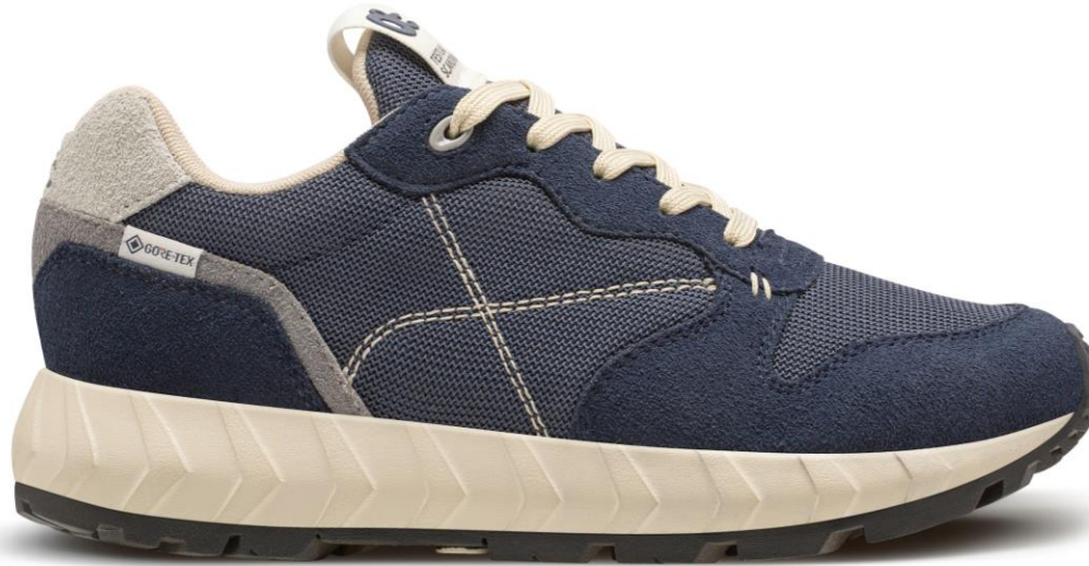
10074-0005 STUREPLAN W GTX/Navy