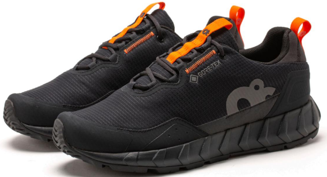
10063-0231 STORO CITYCROSS GTX M/Black/Orange