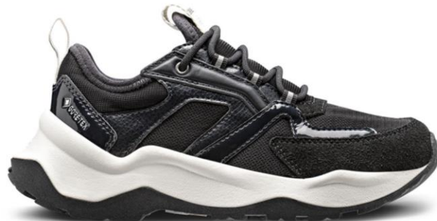
10042-0201 SLUSSEN GTX/Black/White