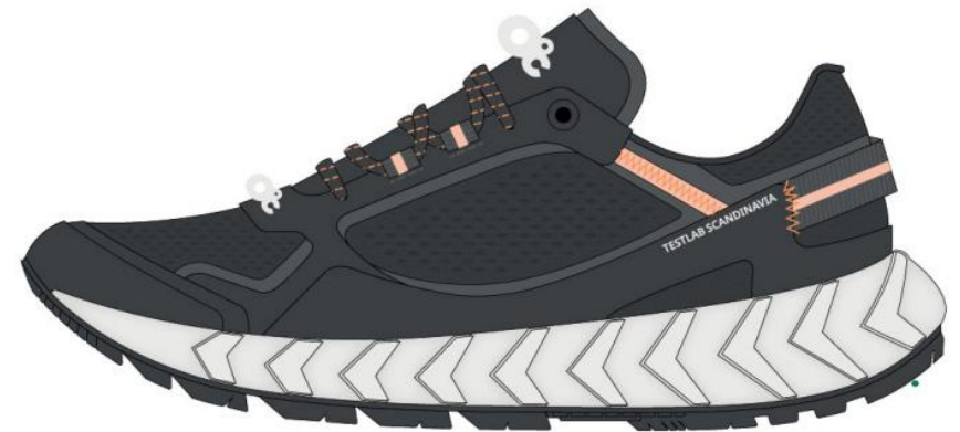
10107-0002 ISLAND HOPPER W Black