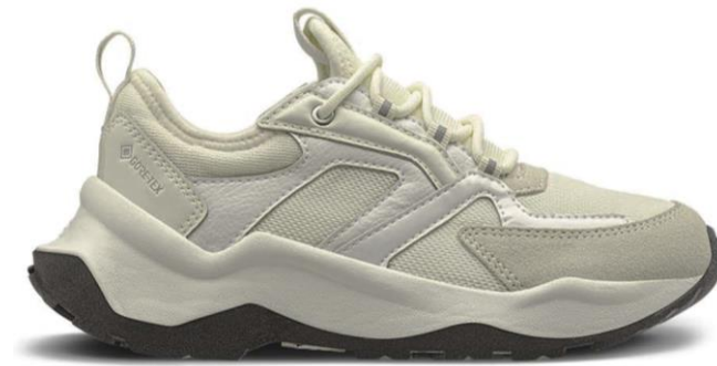
10069-0102 SLUSSEN GTX/White/Black