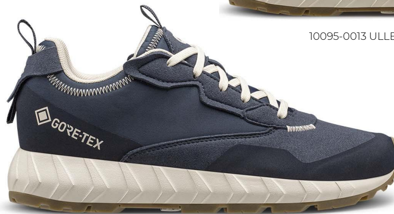
10095-0005 ULLEVI LOW GTX W Navy