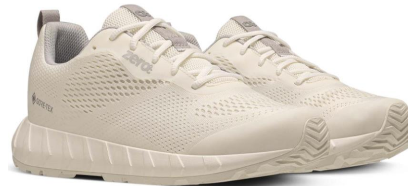
10015-0101 HELSEFYR M/White/White