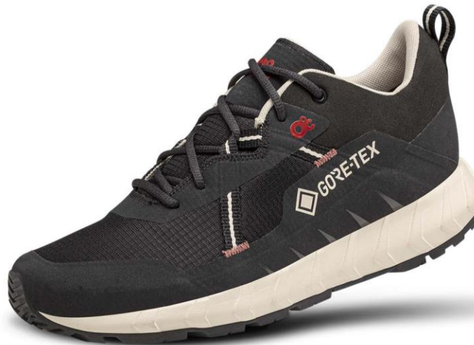
10089-0002 CITYHOPPER LOW GTX M Black