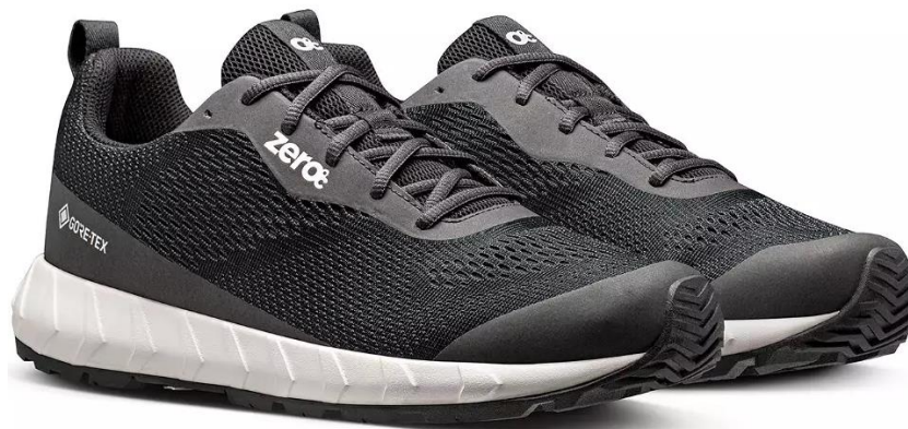
10015-0201 HELSEFYR M/Black/White