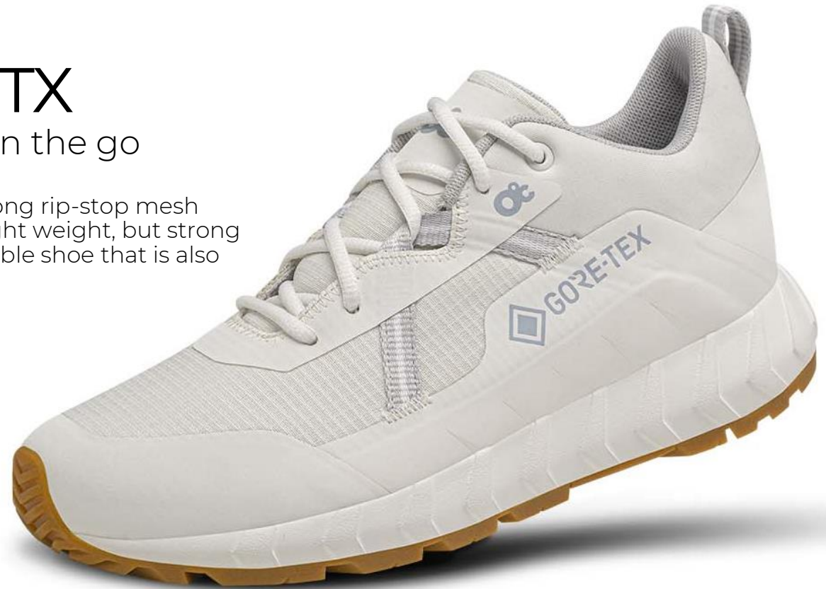
10088-0103 CITYHOPPER LOW GTX W White/Grey