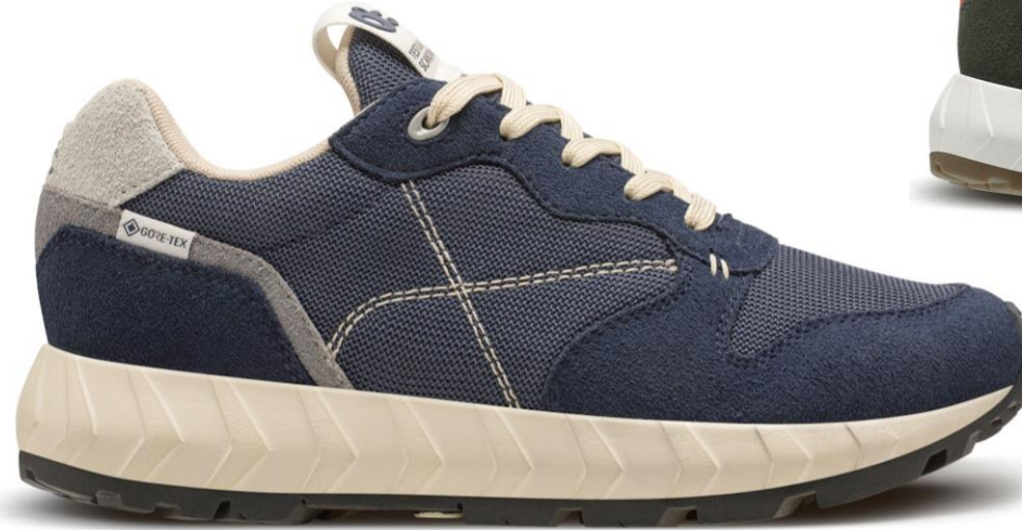
10073-0005 STUREPLAN GTX M/Navy