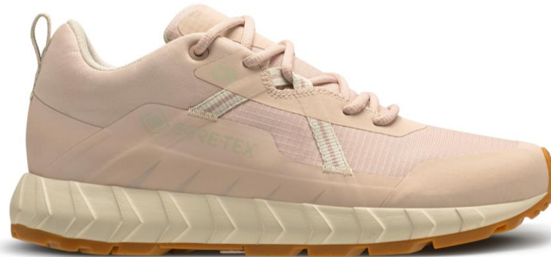
10088-5366 CITYHOPPER LOW GTX W Rose/Cream