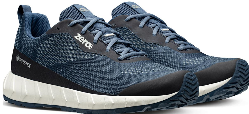
10015-0503 HELSEFYR M/Navy/Grey