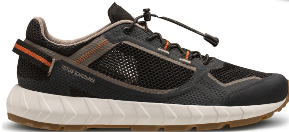
10106-0002 ISLAND HOPPER OPEN AIR M Black