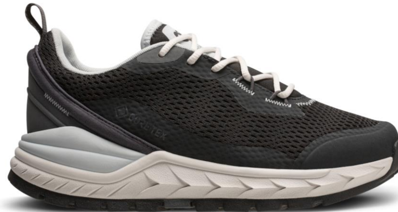
10103-0002 COPENHAGEN CRUISER W GTX/Black