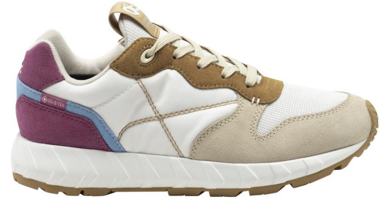
10109-0150 STUREPLAN MIX W GTX/White/Multi