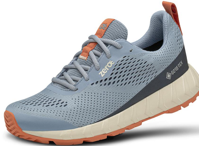
10020-5631 HELSFYR GTX W/Lt. Blue/Orange