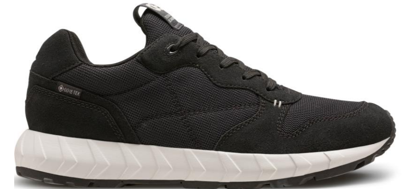
10073-0002 STUREPLAN GTX M/Black