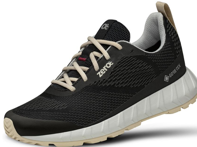
10020-0201 HELSFYR GTX W/Black/White

Our popular and classic Helsfyr sneaker. With a gender specific last, the fit is perfect for women's feet. Made for those who want to look sporty, fashionable and stylish, and at the same time have a lightweight waterproof and breathable shoe which is comfortable to wear.