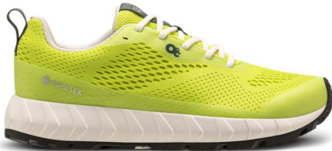
10020-1301 HELSFYR GTX W/Yellow/White