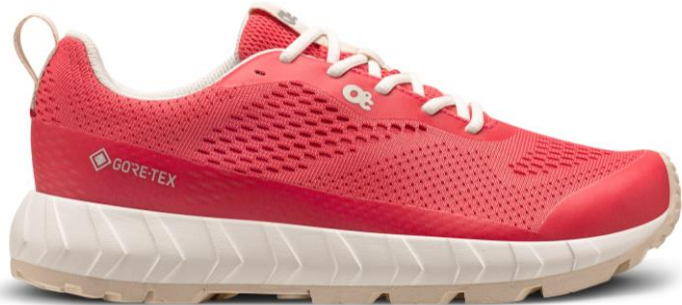
10020-2001 HELSFYR GTX W/Red/White