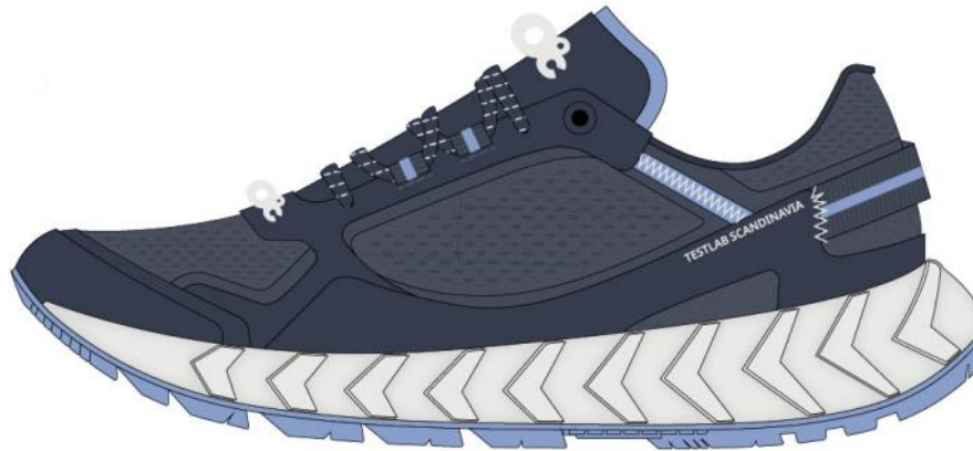
10107-0005 ISLAND HOPPER W Navy