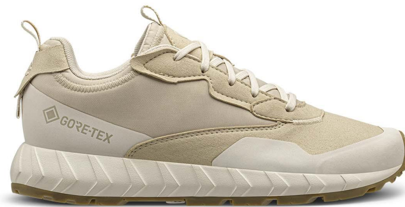
10095-0038 ULLEVI LOW GTX W Beige