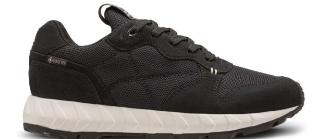
10074-0002 STUREPLAN W GTX/Black