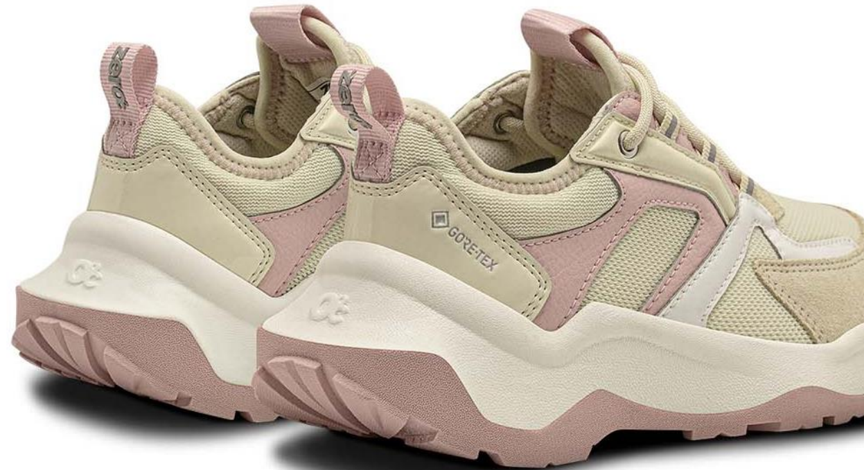
10069-6051 SLUSSEN GTX W/Sand/Coral