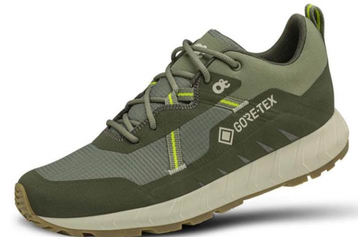
10089-3761 CITYHOPPER LOW GTX M Olive/Khaki