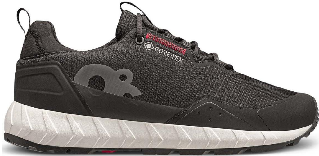
10063-0201 STORO CITYCROSS GTX M/Black/White