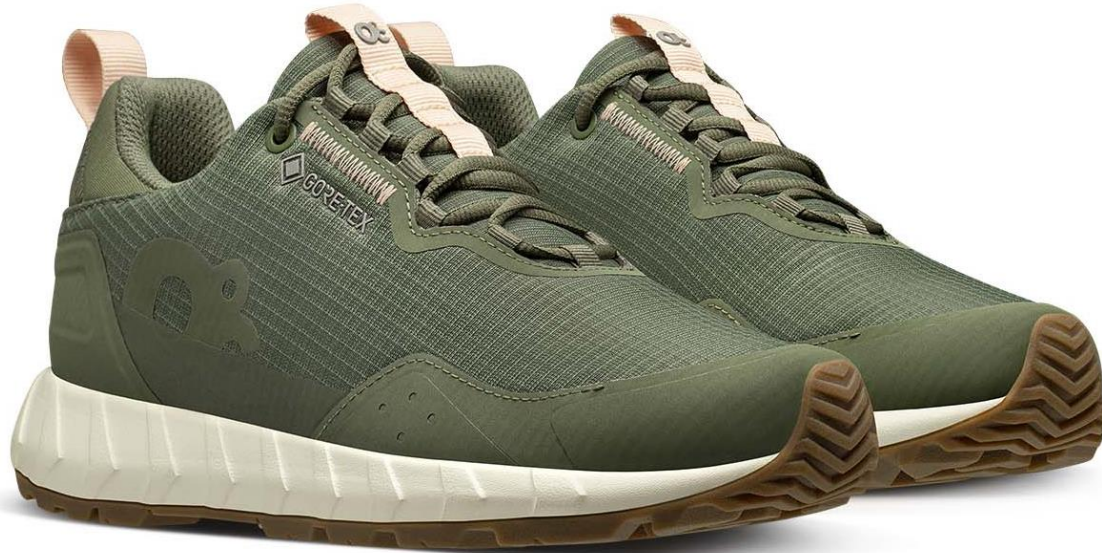
10064-6153 STORO CITYCROSS GTX W/Khaki/Rose