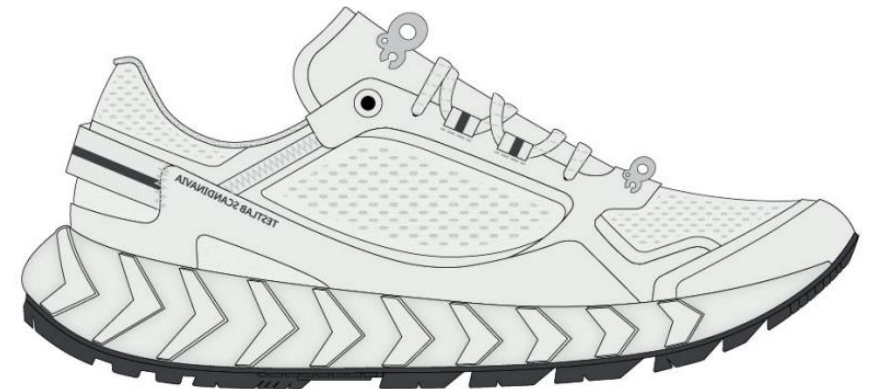
10106-0005 ISLAND HOPPER OPEN AIR M Navy