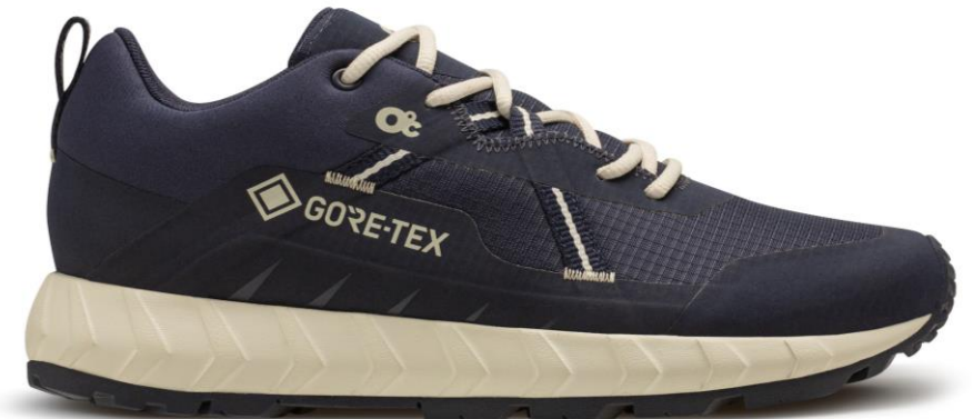
10088-0076 CITYHOPPER LOW GTX W Dk. Blue