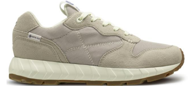
10074-0038 STUREPLAN W GTX/Beige