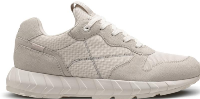
10073-0001 STUREPLAN GTX M/White