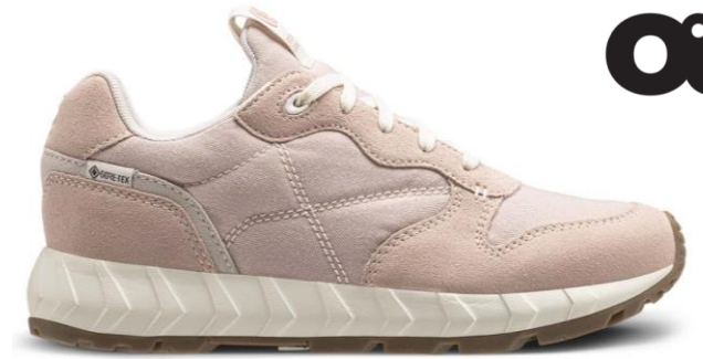
10074-9801 STUREPLAN W GTX/Lt. Rose/White