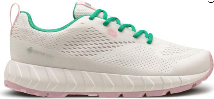
10020-0150 HELSFYR GTX W/White/Multi

Sporty, light-weight sneaker with engineered mesh