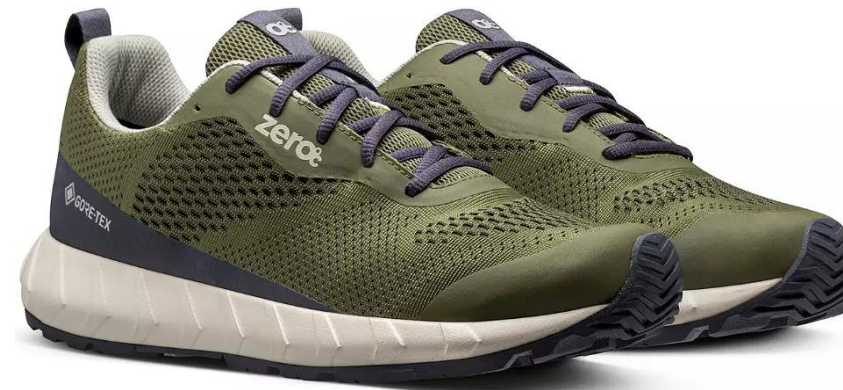
10015-3777 HELSEFYR M/Olive/Charcoal