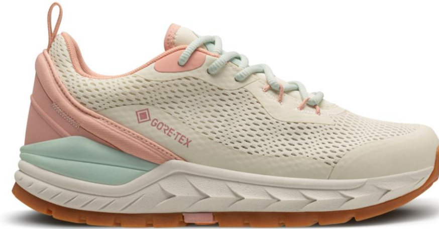
10103-0066 COPENHAGEN CRUISER W GTX/Cream