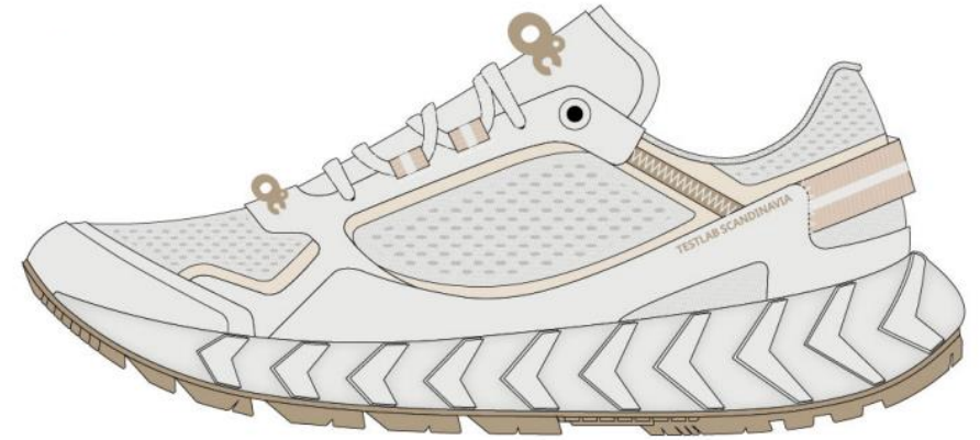
10107-0001 ISLAND HOPPER W White