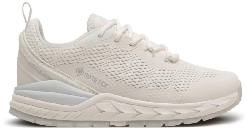
10103-0001 COPENHAGEN CRUISER W GTX/White