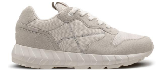
10074-0001 STUREPLAN W GTX/White