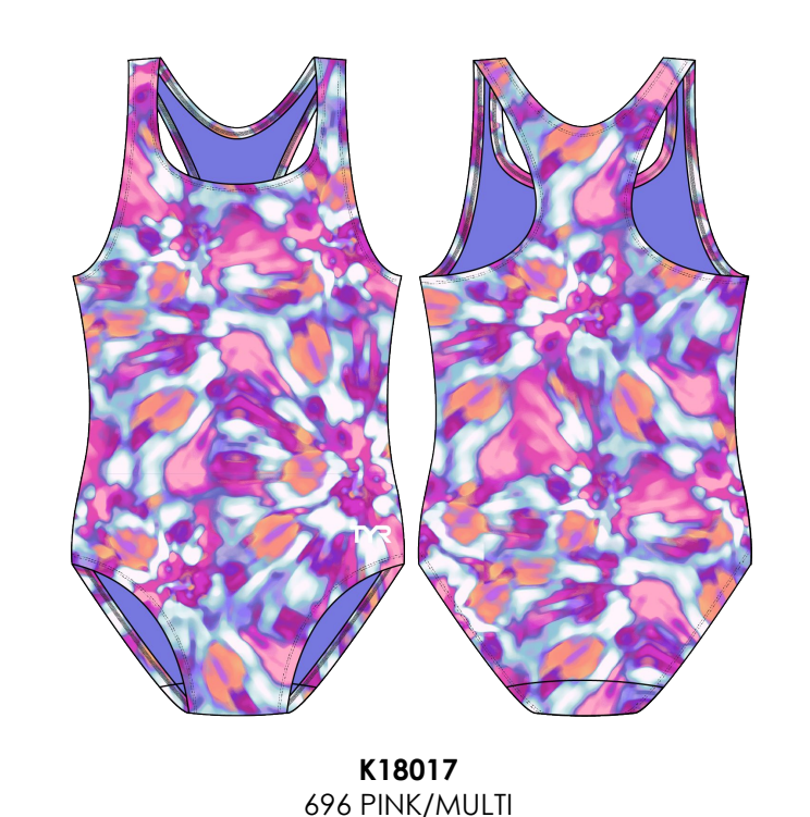
DURAFAST ELITE FABRIC: 94% POLYESTER, 6% SPANDEX