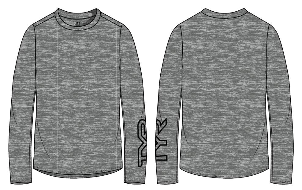
TSKLS7Y 920 IRON HEATHER CARRYOVER