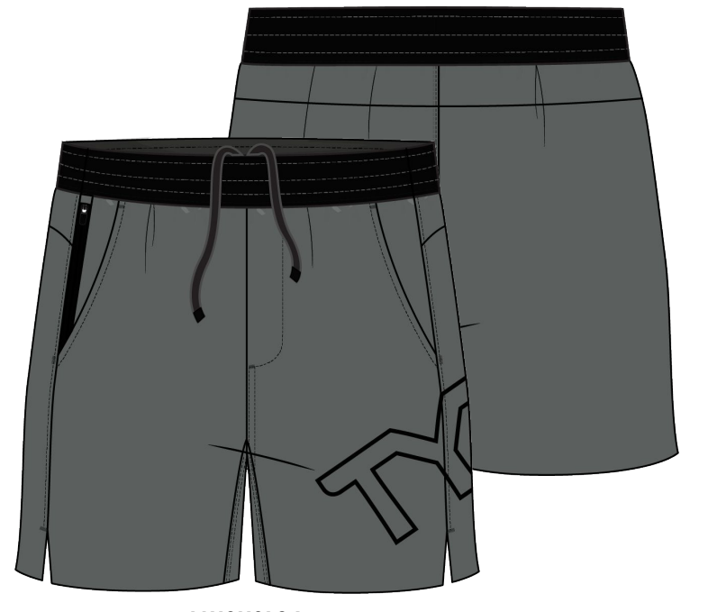
MUSUSL3A 020 GUNMETAL CARRYOVER