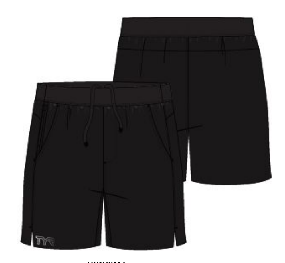
MUSNUS3A 001 BLACK CARRYOVER