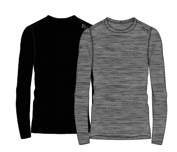
AIRTEC LS TEE