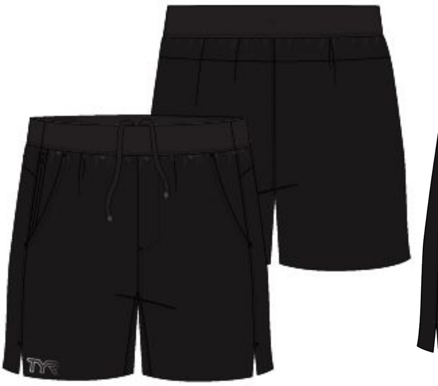
MUSUSO3A 001 BLACK CARRYOVER