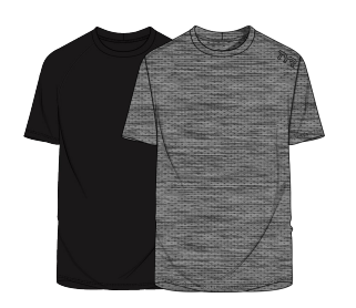
AIRTEC SS TEE