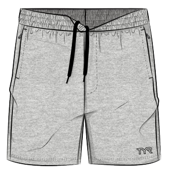
7" KNIT SHORT