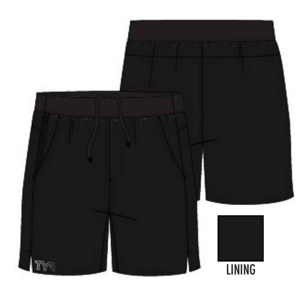
MUSNLS3A 001 BLACK CARRYOVER