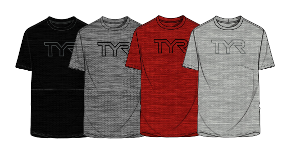
AIRTEC SS TEE - LARGE LOGO