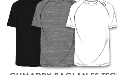
CLIMADRY RAGLAN SS TECH TEE