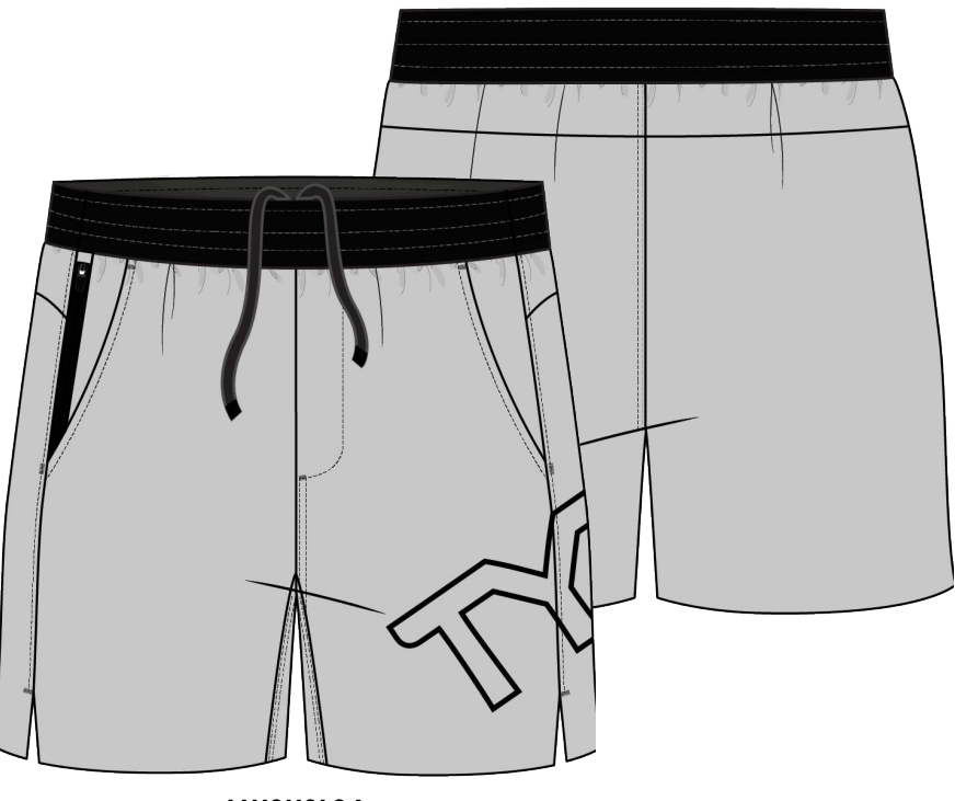
MUSUSL3A 050 LIGHT GREY