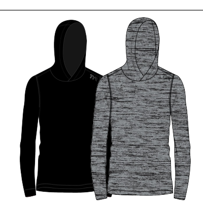
SLS TECH PERFORMANCE HOODIE