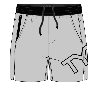
7" UNBRKN - UNLINED - LG LOGO