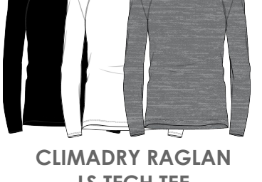
LS TECH TEE