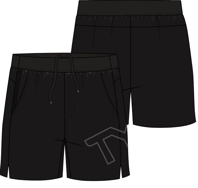
MUSUSL3A 001 BLACK CARRYOVER