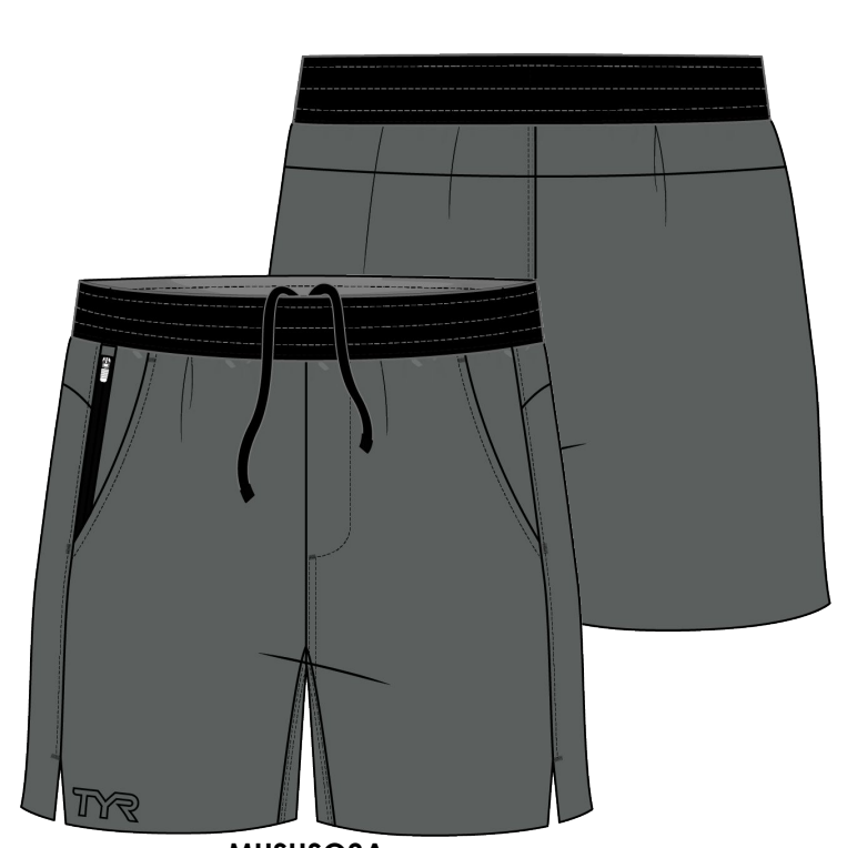
MUSUSO3A 020 GUNMETAL CARRYOVER