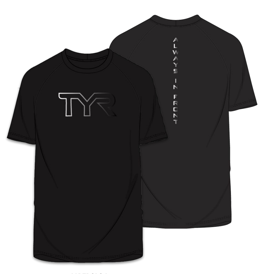
MPTRSL3A 001 BLACK CARRYOVER