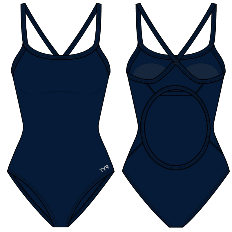
DFSO7A 402 NAVY II CARRYOVER