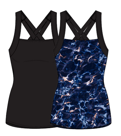
SQUARE NECK TANKINI