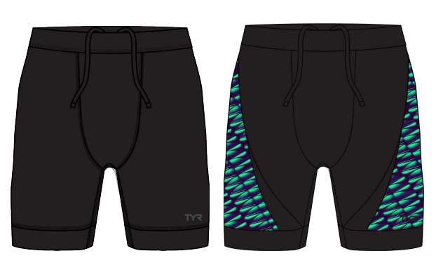
6.5 JAMMER - SOLID