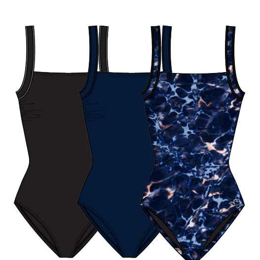
SQUARE NECK CONTROLFIT