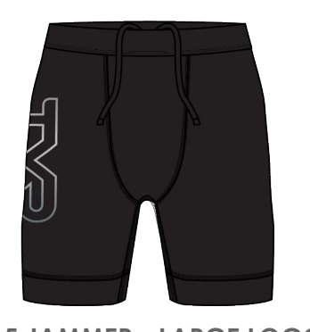
6.5 JAMMER - LARGE LOGO