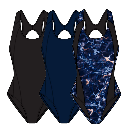
MAX SPLICE CONTROLFIT