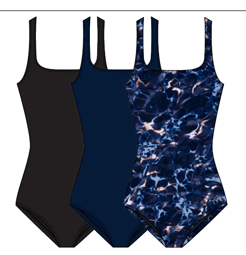
SCOOP NECK CONTROLFIT