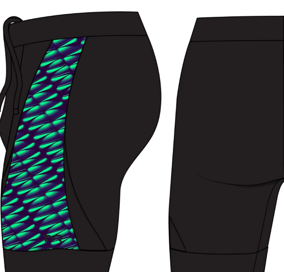
343 GRN/NVY DRAGONFLYTE